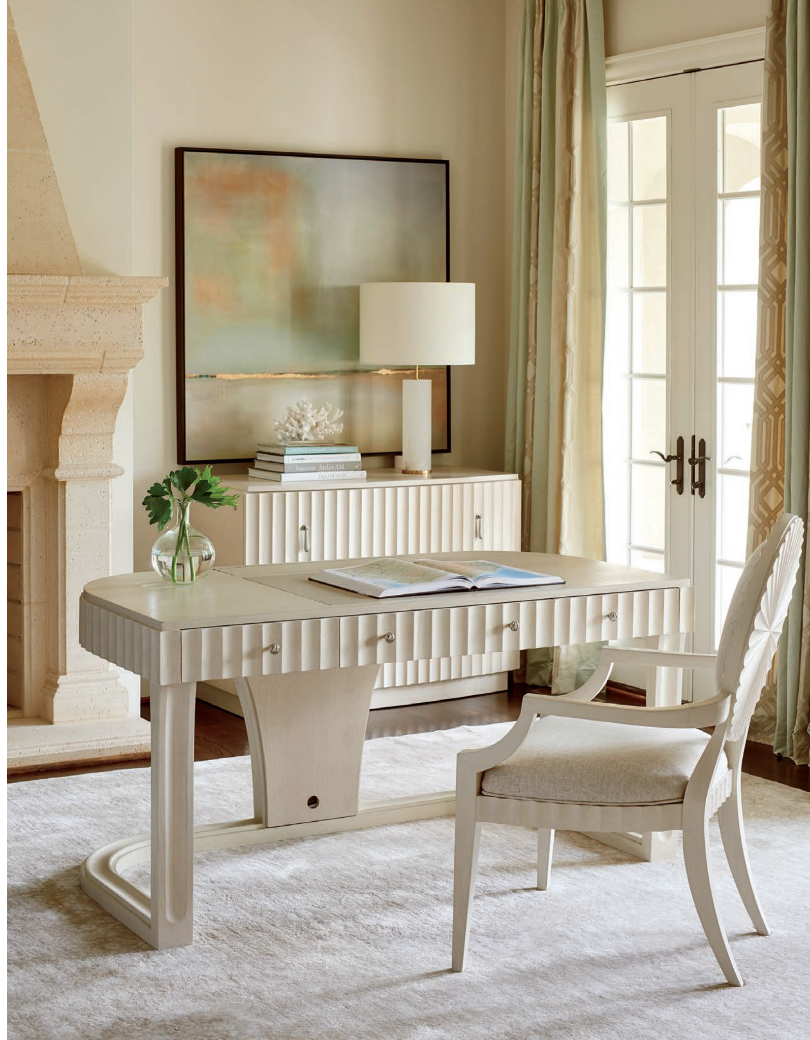
310-937-01 Gilmore Desk Chair 26.25W x 26D x 40H in.

The 60-inch Caledonia writing desk offers a distinctive shelter design with returns on the front that soften the profile while highlighting the elegant scalloped detailing. The front panel serves as a privacy channel for cord management. The top has an inset leather writing surface and a hidden compartment, accessed by touch-latch, with two power outlets and two USB ports. There are three full-extension storage drawers on the working side of the desk.