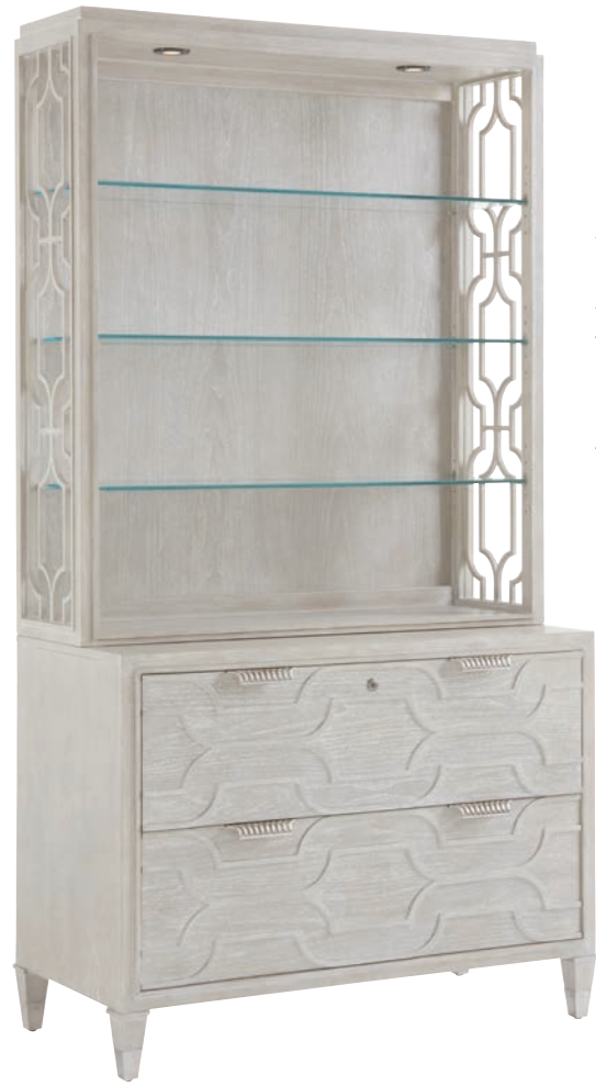
250-441 Octavia Deck 47.5W x 14.25D x 54H in.

The Greystone collection is crafted from walnut veneers in a pearly gray wire-brushed finish with white glaze to highlight the elegant grain lines in the walnut. Custom hardware and finials are finished in brushed nickel. The sophisticated designs blend clean lines with classic elements for a fresh transitional look.