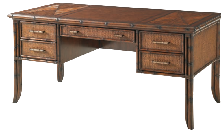
293SA-410 Paradise Isle Writing Desk 64W x 32D x 30H in.

The Paradise Isle desk features a leather writing surface, flanked by inset panels of crushed bamboo, framed with a Rosewood border. Drawer fronts and end panels are clad in woven rattan. There is one file drawer, two storage drawers, and a drop-front keyboard drawer in the center.