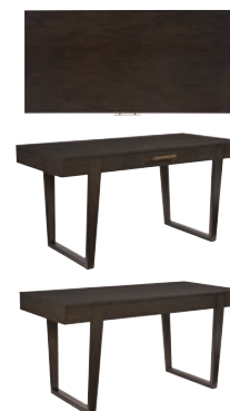
321-410 Revington Writing Desk 60W x 30D x 29.5H in. Knee space 39W x 24.25H in. Tapered open pedestal legs, quartered oak wooden top, one full-extension storage drawer. Shown on pages 26 and 27