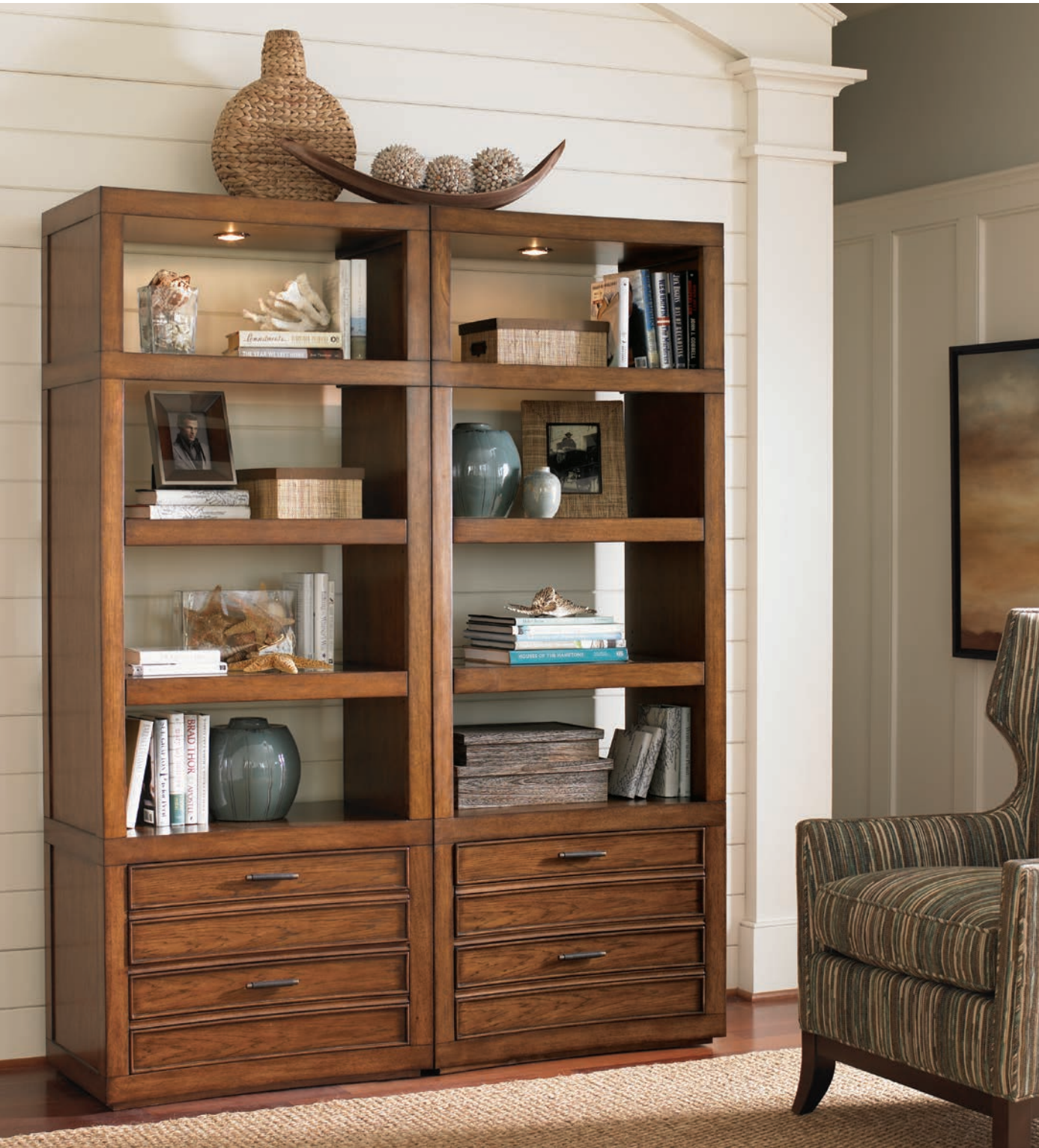
279LK-645 Crystal Sands Bookcase 30W x 18.5D x 77.5H in. The 30-inch Crystal Sands bookcases pair beautifully because of their concave fronts. The design features two adjustable shelves and one stationary shelf at the top, with glass inserts and recessed lighting. The base includes two generous storage drawers.