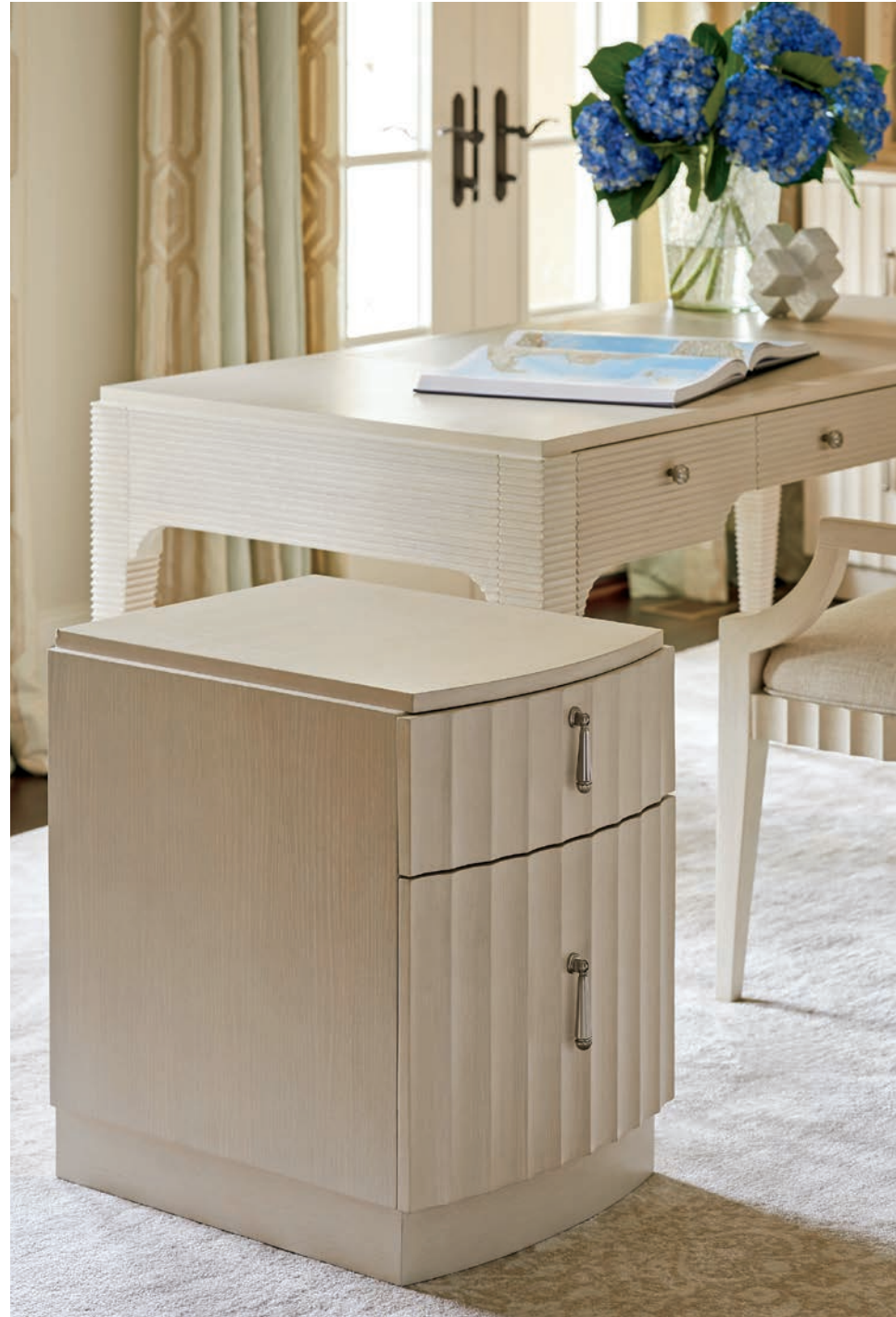
310-452 Ramsey Mobile Single File Chest 17.75W x 22D x 24H in.

The 46-inch Birkdale file chest features two full-extension locking file drawers that accommodate letter or legal files. The deck features three adjustable glass shelves, touch LED lighting, and metal accents in brushed nickel. The smaller Ramsey mobile file chest offers a full-extension storage drawer at the top and a file drawer beneath.