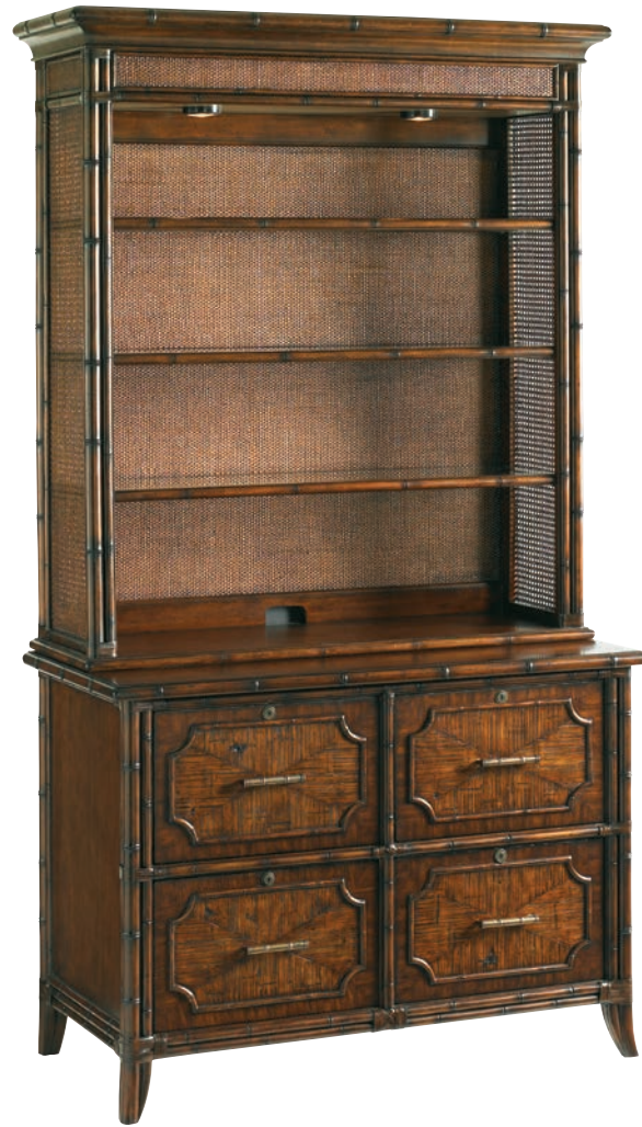
293SA-450 Laguna Beach File Chest 48.25W x 23D x 34.5H in.

The Laguna Beach file chest has four locking file drawers with an elegant crushed bamboo pattern on the fronts. The optional deck has three adjustable wood framed glass shelves, woven cane end panels, and touch lighting.