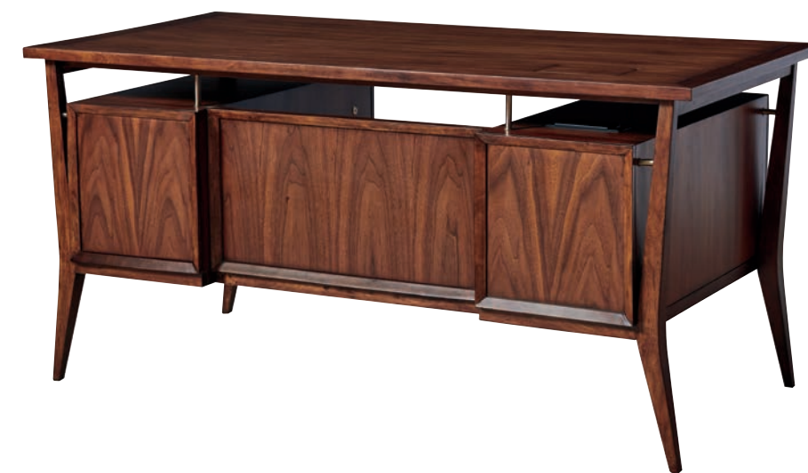
100MC-410 Cranbrook Writing Desk 60W x 30D x 29.5H in.