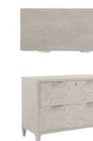
250-450 Octavia File Chest 47.5W x 22.5D x 34.5H in. Accommodates the 441 Octavia Deck Decorative wooden fretwork on drawer fronts, 2 full extension file drawers accommodate legal or letter files, removable storage tray in each drawer. Locking top drawer. Metal ferrules in a brushed nickel finish. Shown on pages 32, 33 and 35