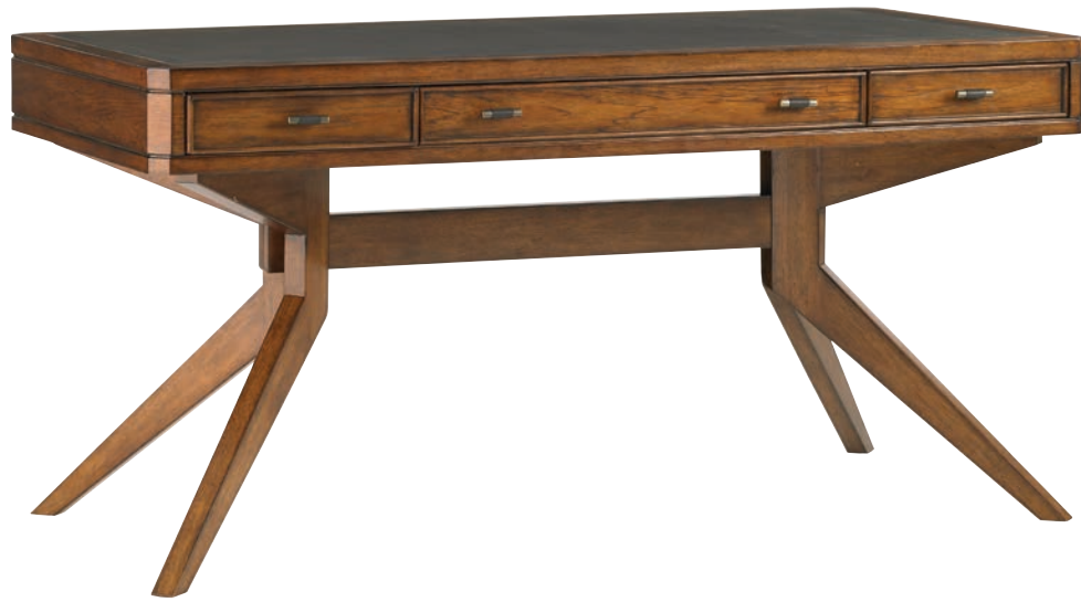
279LK-410 Lido Shores Desk 60W x 31D x 30H in.

The casual yet sophisticated styling of Longboat Key is born of clean contemporary lines, bold architectural details, and a warm sundrenched Sienna finish. Crafted from Hickory veneers, designs feature distinctive metal accents and custom brass hardware wrapped with faux leather.