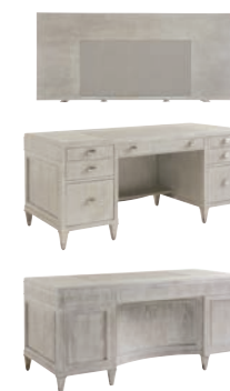
250-400 Avery Executive Desk 68.5W x 30.5D x 30H in. Knee space 31.25W x 24.5H in. Metal ferrules in a brushed nickel finish. Left side facing: 2 full extension storage drawers (locking center drawer) and 1 full extension locking file drawer will accommodate legal or letter files. Removable dictation tray will work on left or right side. Cord management access. Center: Faux leather writing surface. Full extension drop-front pullout keyboard drawer and removable pencil tray. 1 shelf on bottom of case. Cord management access. Right side facing: 2 full extension storage drawers and 1 full extension file drawer will accommodate legal or letter files. Cord management access. Shown on page 35