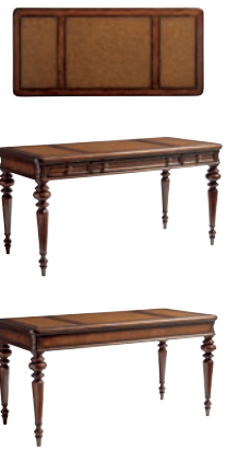
305-412 Rosslyn Writing Desk 60W x 28D x 30H in. 3 full extension self closing drawers, faux leather writing surface. Shown on page 53