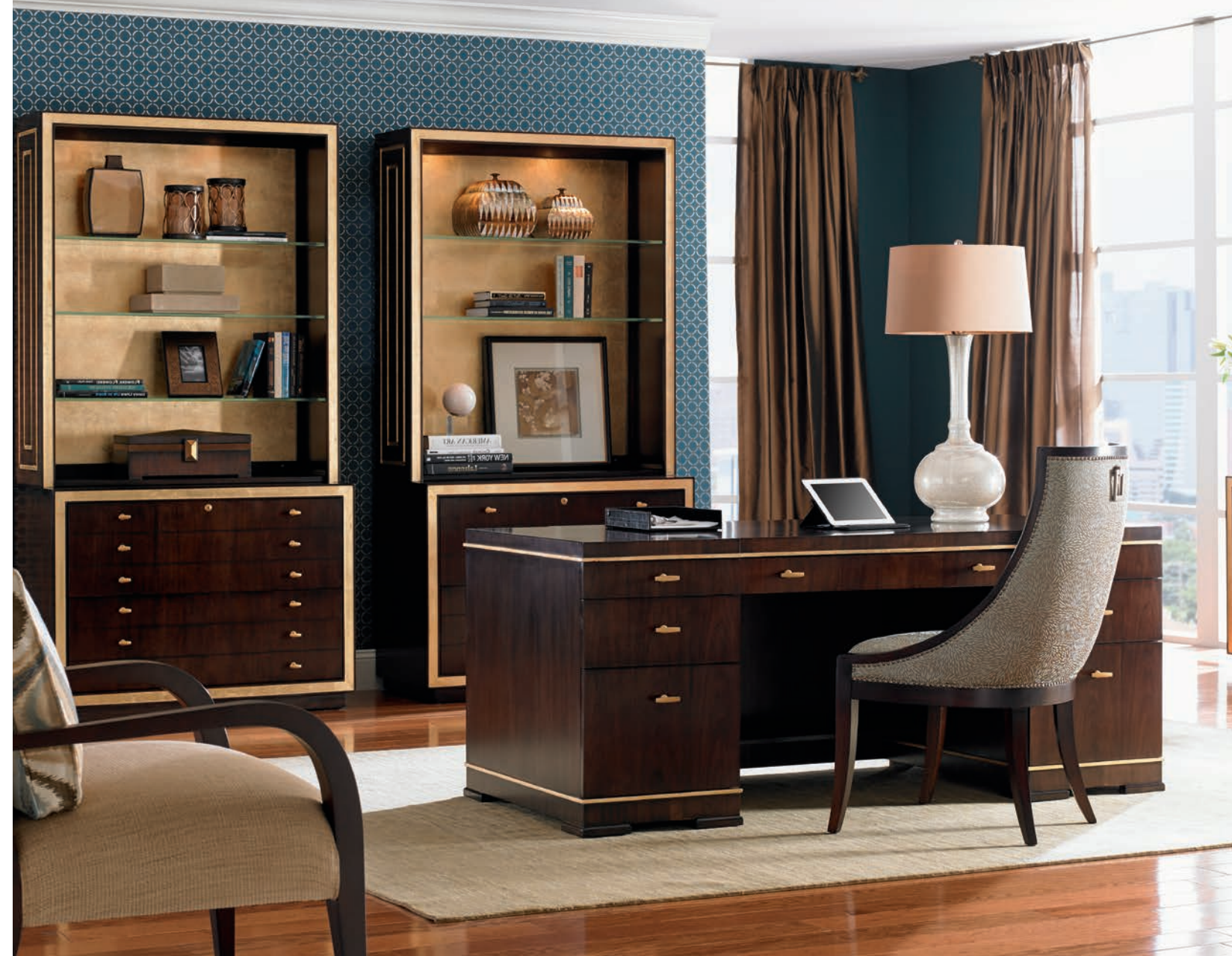
307HW-400 Paramount Executive Desk 72.5W x 34.5D x 30H in.