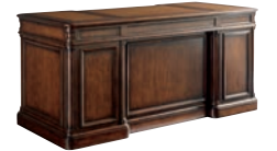
305-400 Morgan Executive Desk 66W x 30D x 30.5H in. Knee space 28.5W x 25H in. Faux leather writing surface with decorative tooling. Left and right side facing: 3 full extension self closing storage drawers and 1 full extension locking file drawer will accommodate legal or letter files. Center: Full extension self closing drop-front pullout keyboard drawer. 1 shelf on bottom of case. Shown on page 52