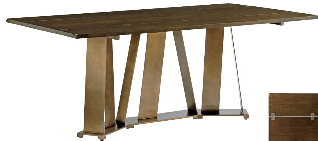
190-470 Gateway Flip-Top Console Open 72W x 40D x 28.75H in. Closed 72W x 20D x 29.75H in.