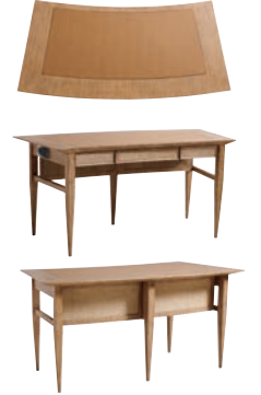
100FL-410 Aegis Writing Desk 63.5W x 30.5D x 29.5H in. Knee space 44W x 24.5H in. Transitional radial shaped writing desk crafted from select hardwoods and white oak veneers in a wirebrushed light brown finish. 3 storage drawers and modesty panel with contrasting woven cane panels. Five tapered legs and faux leather writing surface. Mounted 2 powered USB power jacks with tamper resistant receptacles and cord management. Shown on page 82