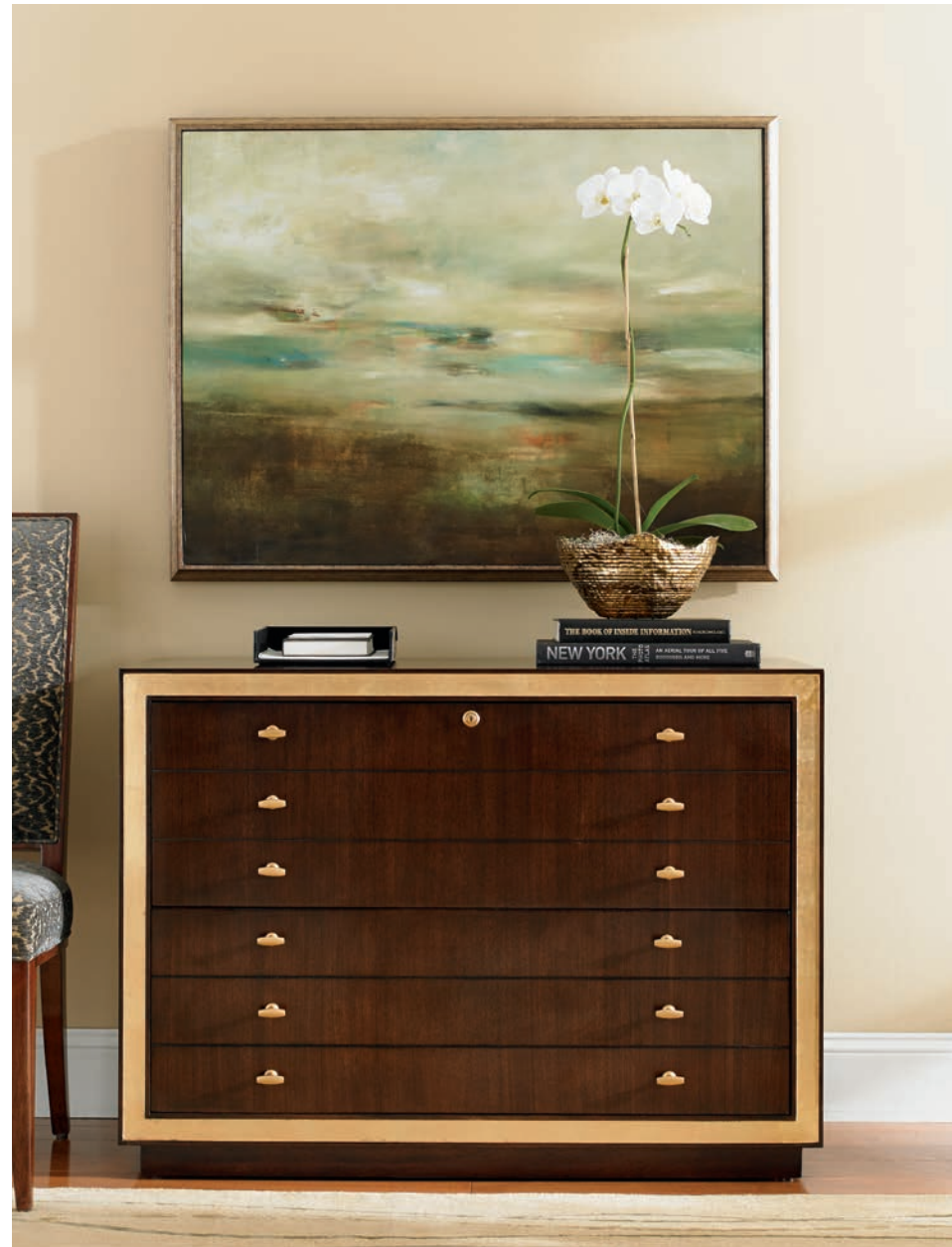
307HW-450 Beverly Palms File Chest 44W x 21D x 32H in.

Inspired by the timeless Greek Key design, Bel Aire's fresh contemporary styling sets the tone for the most elegant interiors. Exceptional office and media designs are beautifully crafted in Walnut, rewarding the discerning eye with accents of hand-applied gold leaf for a distinctive statement of style.