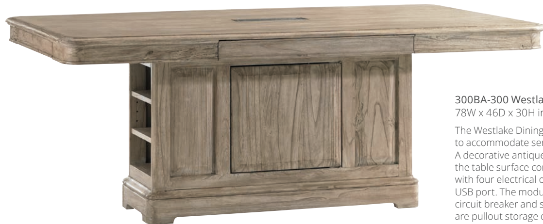
300BA-300 Westlake Dining/Work Table 78W x 46D x 30H in.

The Westlake Dining Table is designed to accommodate serious multi-tasking. A decorative antique pewter pivot door in the table surface conceals a power module with four electrical outlets and a powered USB port. The module is equipped with a circuit breaker and surge protection. There are pullout storage drawers on all four sides of the table, open storage with adjustable shelves on both ends of the pedestal base, and a hidden compartment behind a touch latch door on both sides of the base.