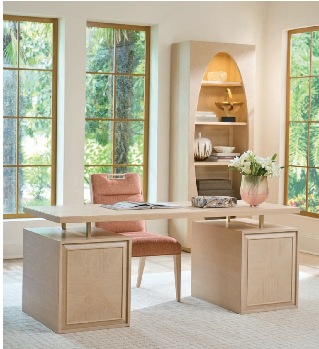
325-420 Apogee Modular Top 74W x 28D x 1.75H in.

Height with brackets attached 6.25 in. Includes two metal brackets for attachment purposes.