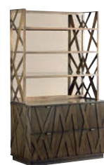
190-441 Prism Metal Deck 44W x 14D x 45H in. Complements the 450 Prism File Chest Decorative metal fretwork on end panels, bronze mirrored back panels, 3 stationary glass shelves. Shown on pages 56, 57 and 58