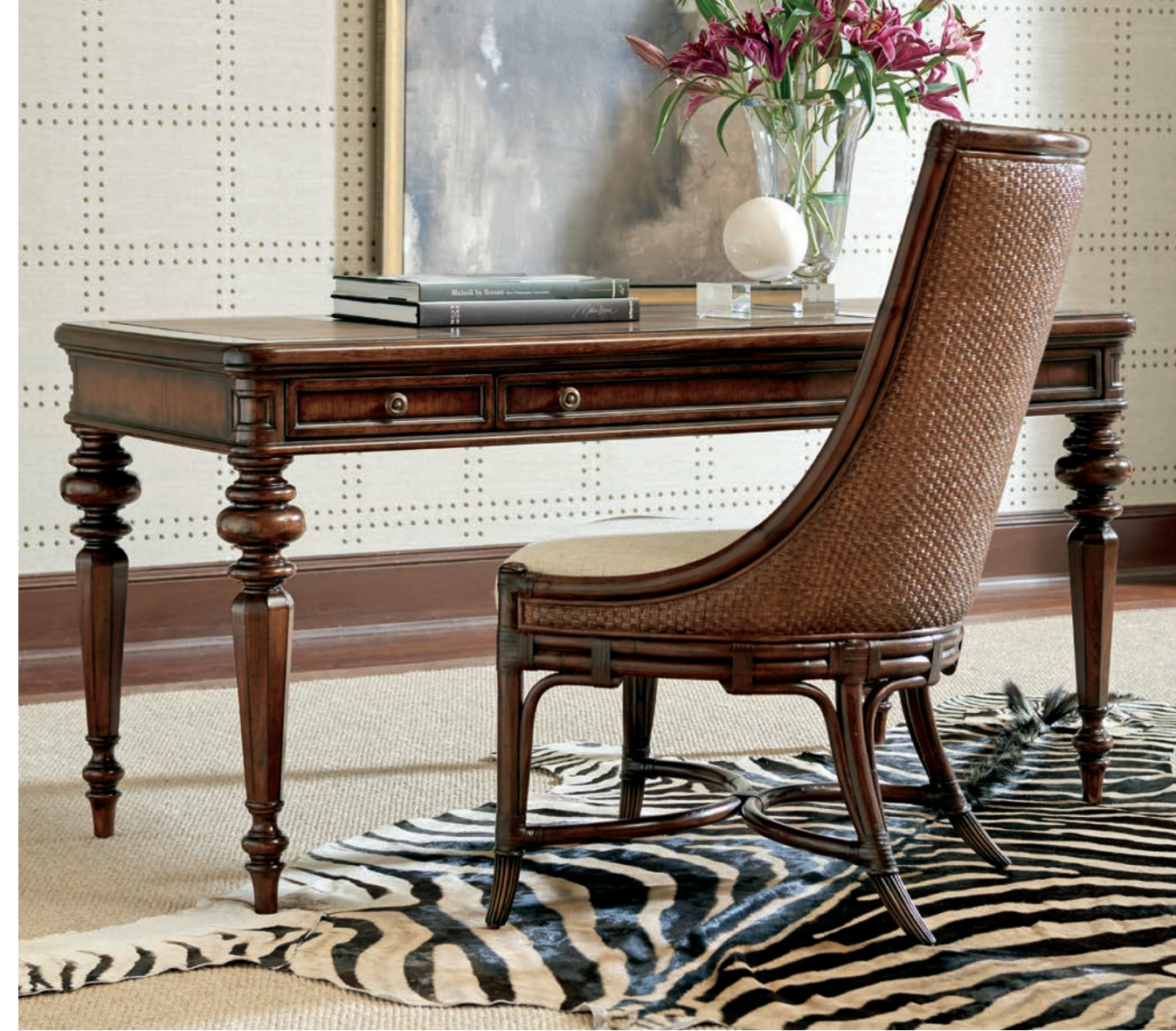
305-412 Rosslyn Writing Desk 60W x 28D x 30H in.