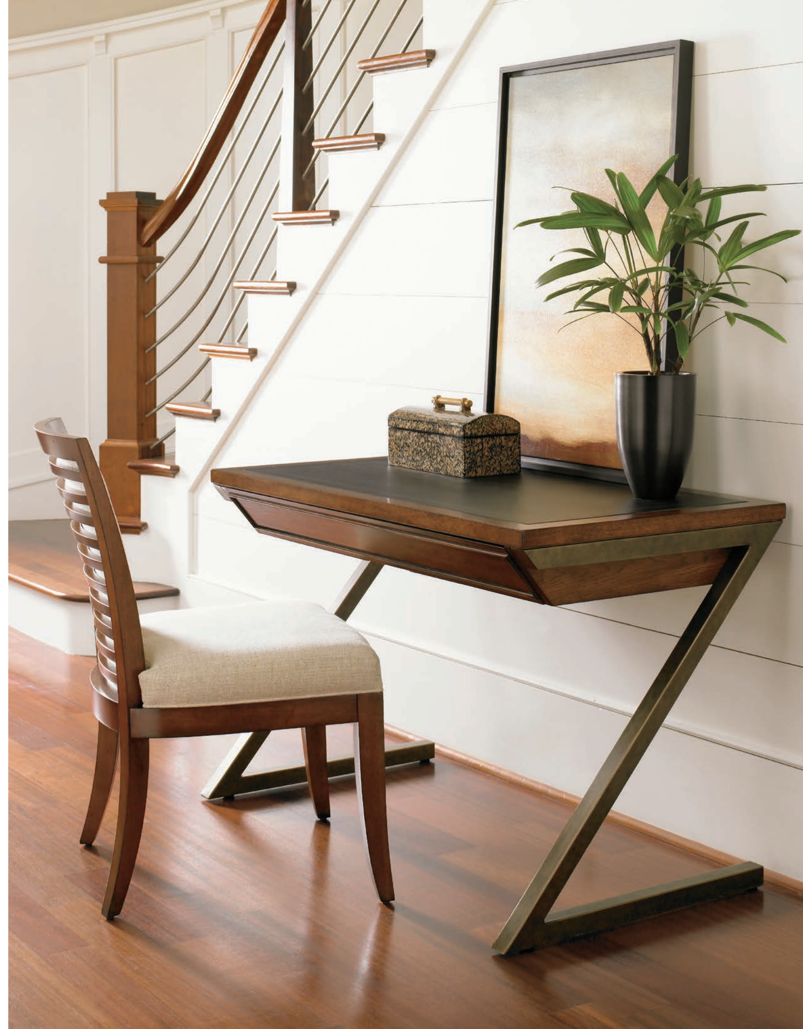
279LK-411 Harborview Desk 46W x 27D x 30H in. The Harbourview desk, with its dramatic Z-shaped metal base, features a leather top with gold tooling and a full-length drawer for storage. The smaller scale offers a designer look for compact work spaces.