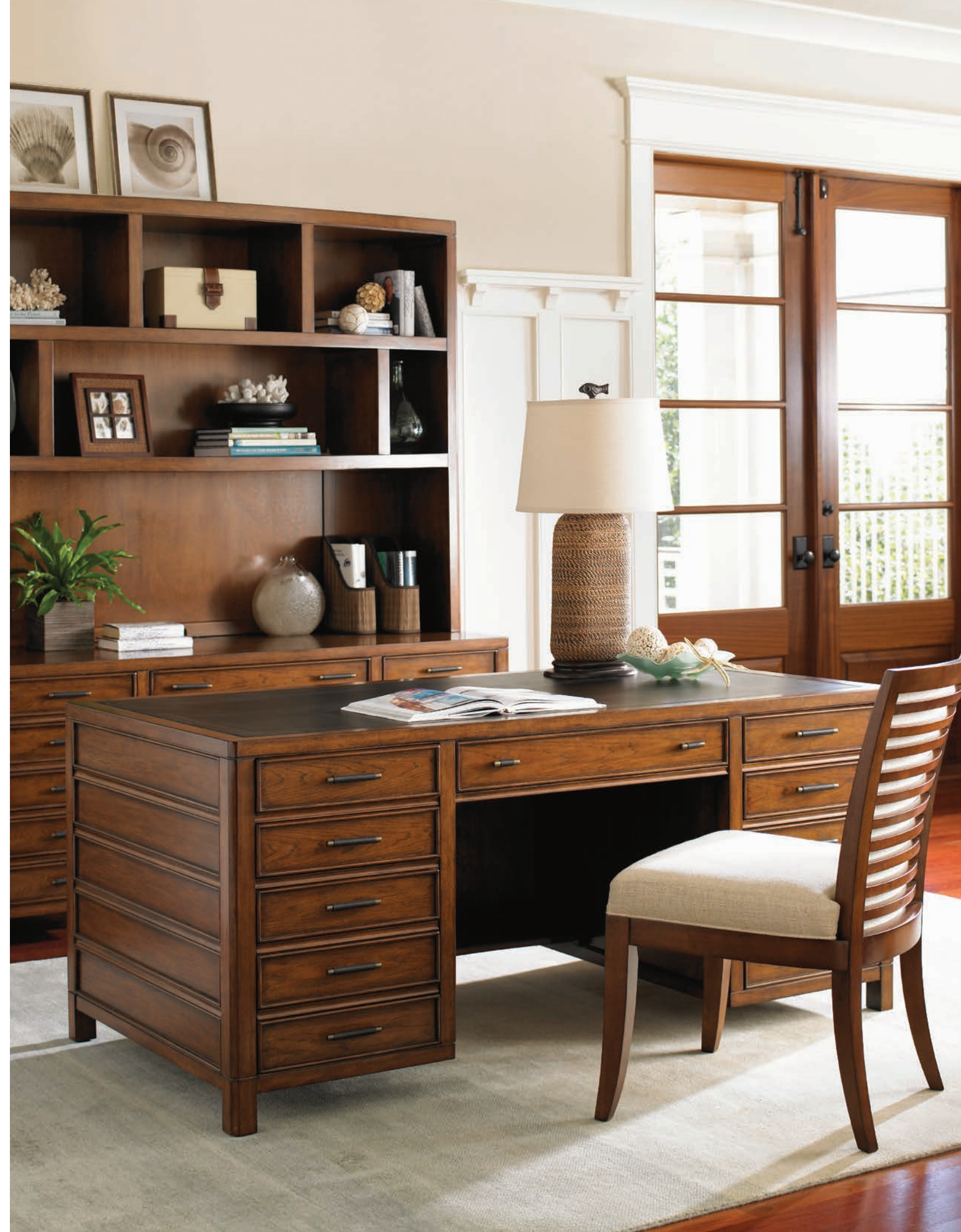
536-882-01 Kowloon Side Chair 22.25W x 24.5D x 36H in.

The Bal Harbour executive desk features a leather top with gold tooling. There are four storage drawers and two full-extension file drawers that accommodate letter or legal files. The center drawer features a drop-front for a keyboard and mouse.