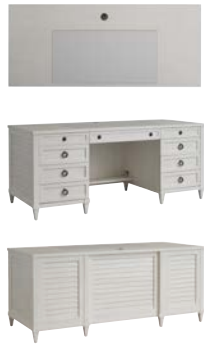
320-400 Bradenton Executive Desk 70W x 30D x 29.5H in. Knee space 29W x 24.25H in. Top: Decorative metal grommet in satin nickel finish Left side facing: 2 storage drawers. Middle storage drawer locks when file drawer is locked. 1 locking file drawer that will accommodate legal or letter files, 3 plug power supply with USB charging jack, cord management and grommet for cord management Center: Brisa leather writing surface, 1 storage drawer, 1 shelf Right side facing: 2 storage drawers, 1 file drawer that will accommodate legal or letter files, grommet for cord management Shown on page 30