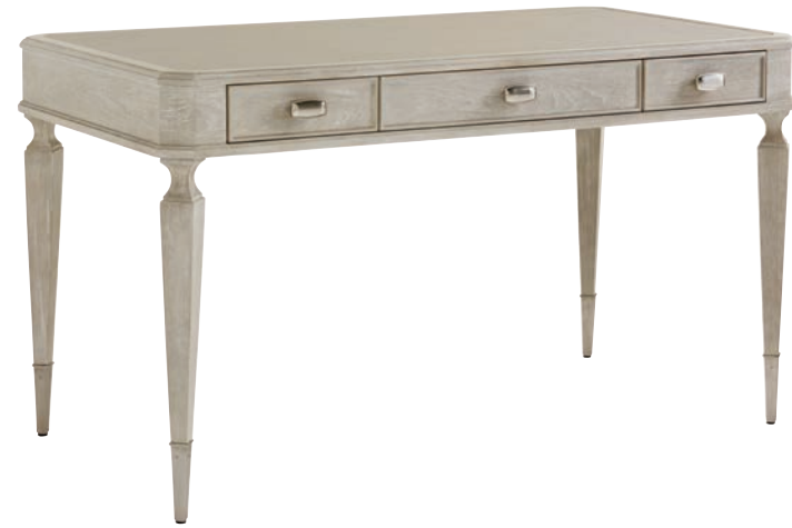
250-412 Chloe Writing Desk 54W x 28D x 30H in. 1577-13 Aqua Bay Chair 27W x 29D x 41H in.