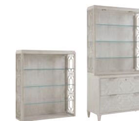
250-441 Octavia Deck 47.5W x 14.25D x 54H in. Complements the 450 Octavia File Chest Decorative laser cut wooden fretwork on end panels, 3 adjustable ultra clear tempered glass shelves, touch LED lighting. Shown on pages 32, 33 and 35