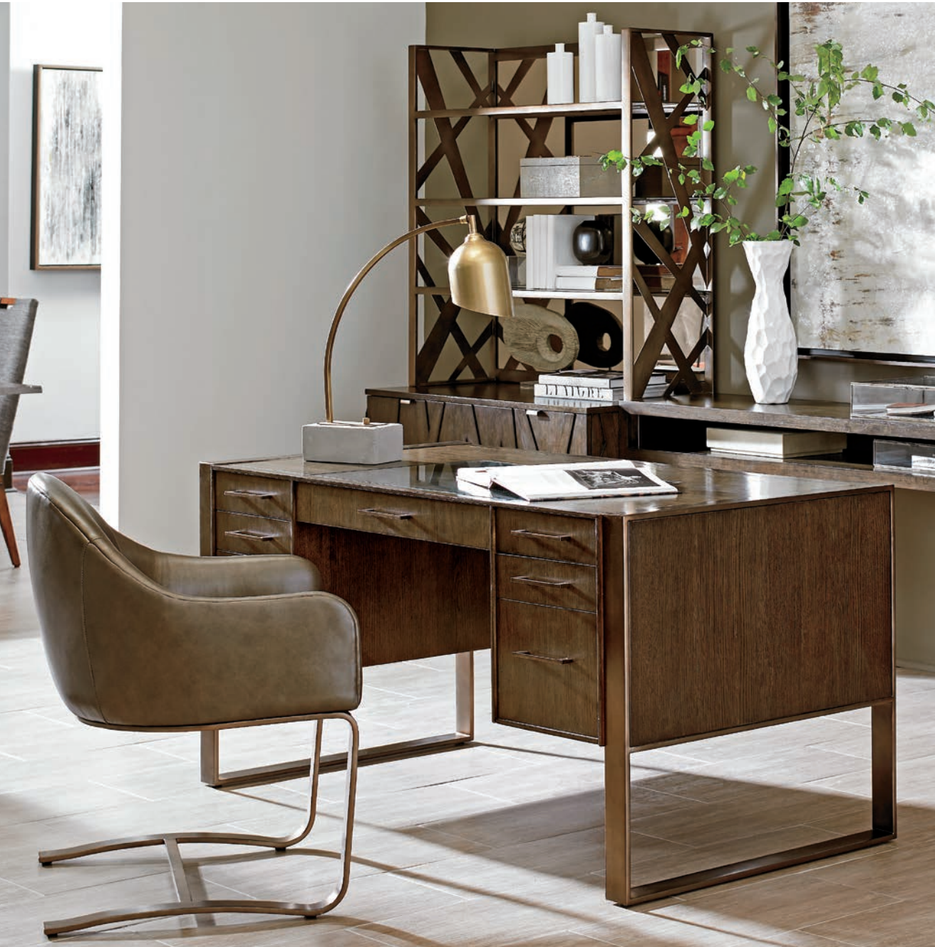
190-411 Structure Desk 60W x 30.5D x 30H in.

Crafted from quartered white oak veneers in a rich mocha coloration, Cross Effect offers an innovative fusion of contemporary and industrial design, featuring striking metal bases and custom metal accents in bronze-finished silver leaf. Asymmetrical styling offers a slight urban edge to the look, enhancing its modern aesthetic and sophisticated appeal.