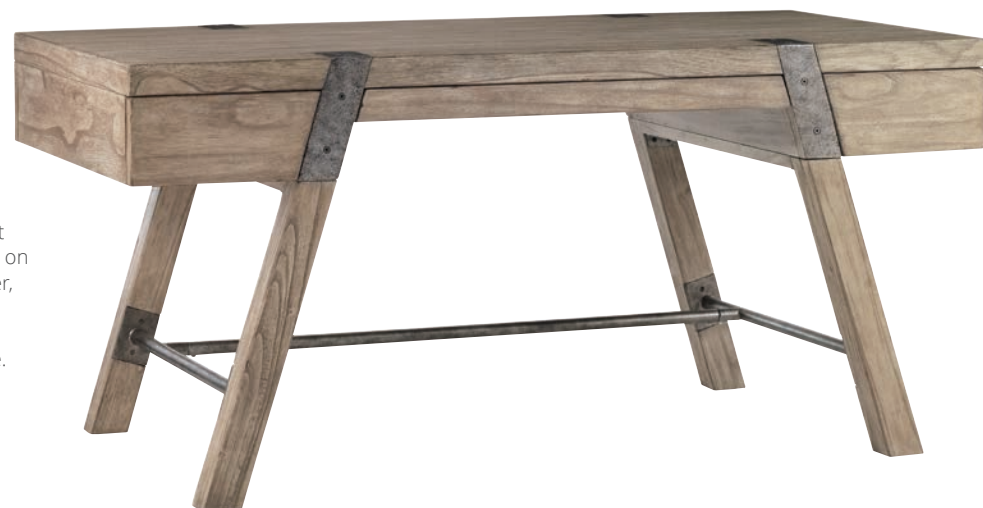
300BA-410 Wyatt Desk 64W x 32D x 30H in.

The Johnson file chest is designed to look like a classic 6-drawer map chest. In reality, it features two large file drawers. The optional deck features a vintage industrial style metal frame in an x-pattern with rivets and three fixed shelves for storage.