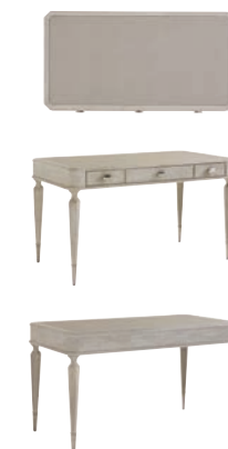
250-412 Chloe Writing Desk 54W x 28D x 30H in. Faux leather top, 3 drawers (removable pencil tray in center drawer). Partitioned leather drawer box that can be used in left or right side facing drawers. Metal ferrules in a brushed nickel finish. Some assembly required Shown on page 34