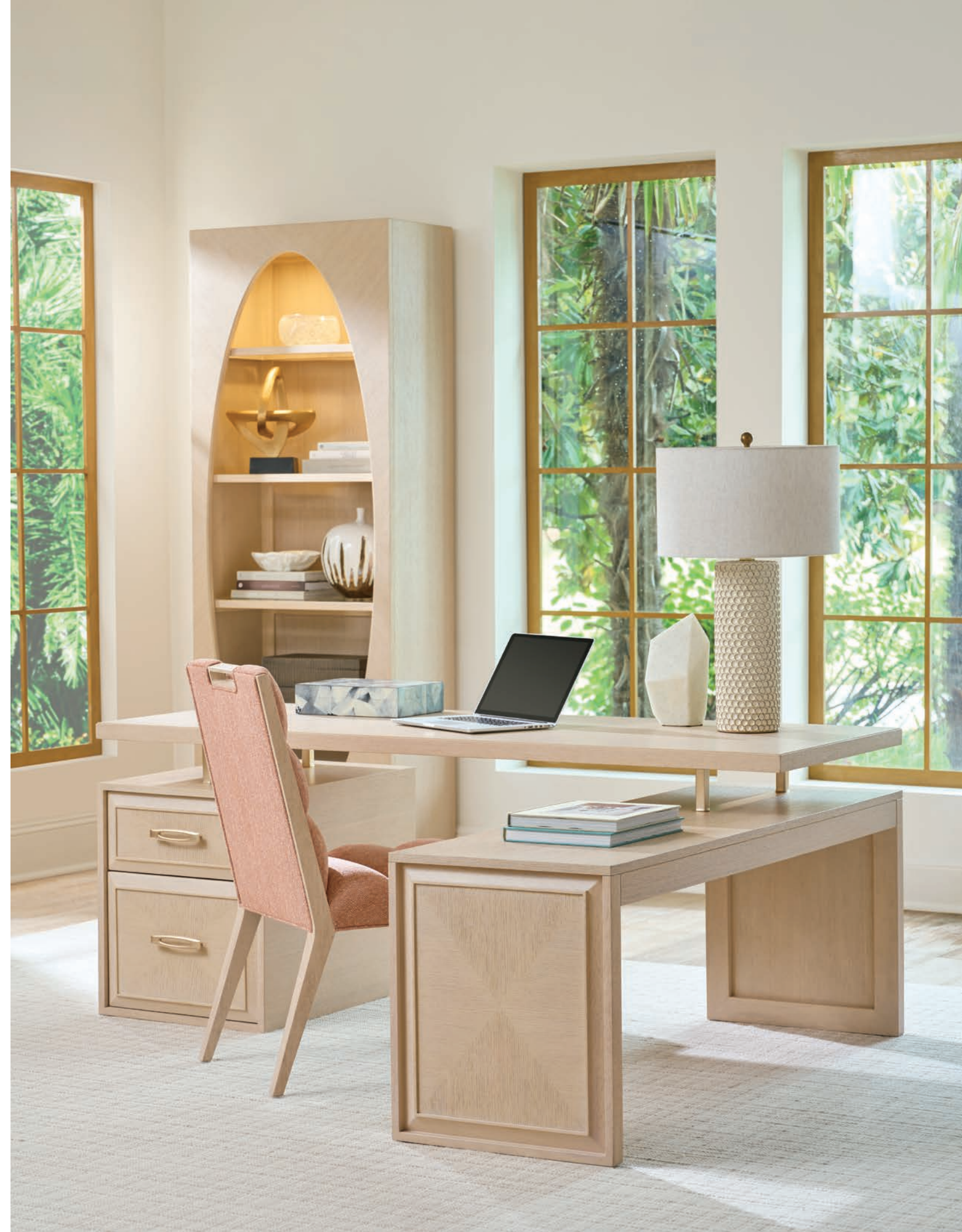
578-882 Aiden Channeled Upholstered Side Chair 21W x 26D x 37H in.

Overall Size as shown 74W x 60.25D x 29.5H in.