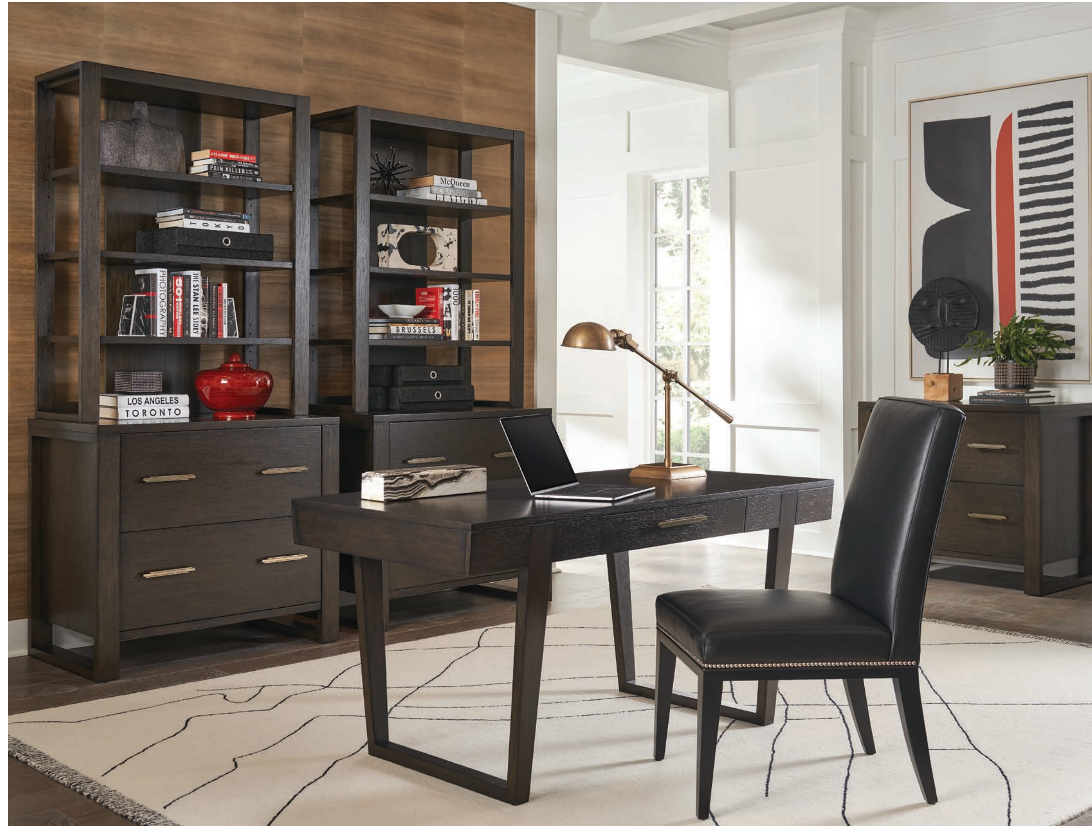
LL1847-12 Lowell Leather Side Chair 21W x 28D x 40H in.

Two full-extension drawers accommodate legal or letter files. The open base design gives the piece a floating appearance. See the following page for a side profile view. This piece pairs with the 441 Hewitt Deck.