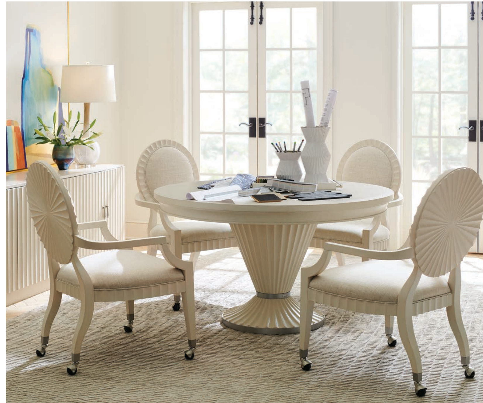
310-300C Artesia Game Table 54 diameter x 30H in.

The 54-inch diameter Artesia game table features a radial matched veneer pattern on the top, with a tapered base that highlights the scalloped design detail. The Preston game chairs offer a great pairing.