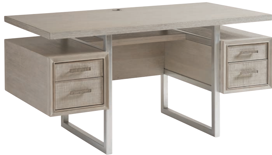
324-441 Wheaton Deck 41.5W x 14D x 51H in.

The floating desk top design, with grommets pass-thru access, allows for book or magazine storage beneath the top surface. Four raffia-clad drawers offer ample storage on the working side of the desk. The three front panels are also clad in woven raffia for a striking look. The metal base is finished in silver leaf.