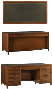
279LK-400 Bal Harbour Desk 68W x 35D x 30H in. Knee space 28.25W x 23.5H in. Leather top with gold tooling; 6 drawers (2 full extension file drawers will accommodate legal or letter files); drop-front keyboard drawer with ergonomic palm rest; 1 shelf; cord management Shown on pages 40 and 41