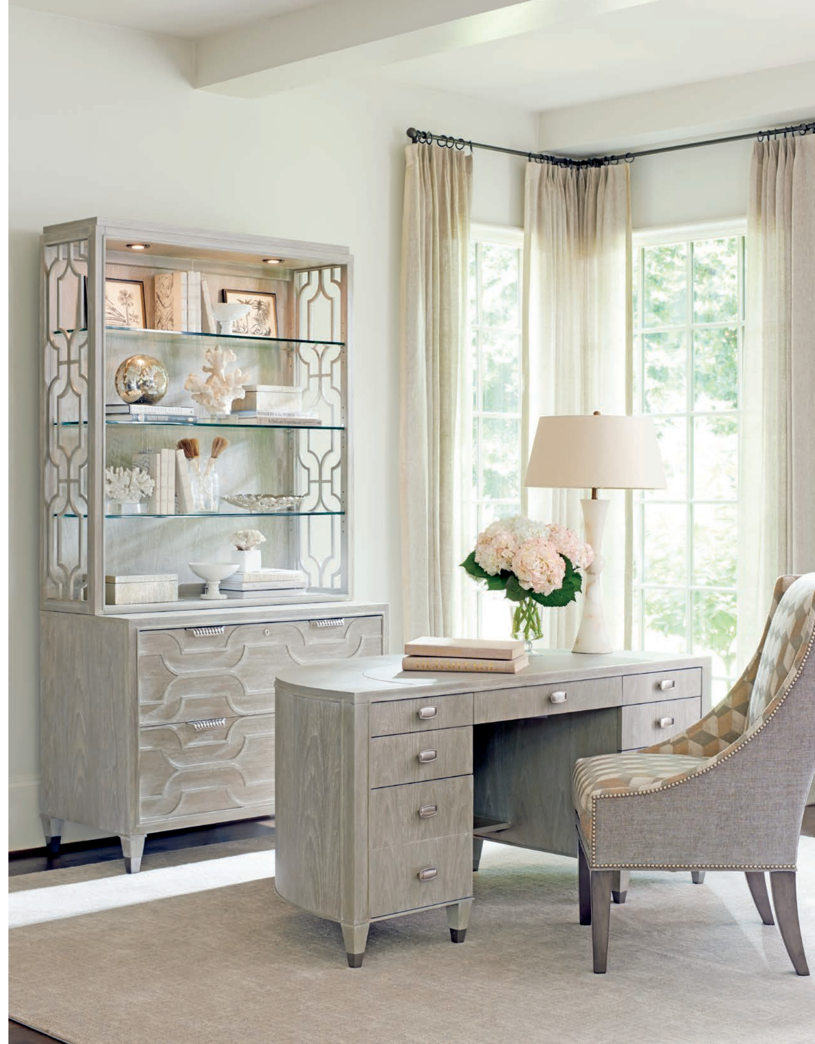
1500-13 Stonepine Chair 24.5W x 30D x 42H in.

The Dylan Demilune desk, shown on the opposite page, is a beautiful design statement, featuring a graceful curved front that showcases cathedral grain patterns of the Walnut veneers. The desk features seven storage drawers and one letter-sized file drawer. The arched writing surface on the top is an inset of gray Brisa leather.