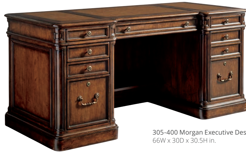
305-400 Morgan Executive Desk 66W x 30D x 30.5H in.

The Morgan executive desk offers remarkable storage and filing capacity for a design that is only 66 x 30-inches in size. A Brisa leather writing surface with decorative tooling offers a sophisticated look. In each pedestal are three full-extension self-closing drawers for storage, beneath which are lockable full-extension drawers for letter or legal files. The center drawer has a drop-front to accommodate a keyboard and there is a privacy shelf in the bottom section of the interior compartment.