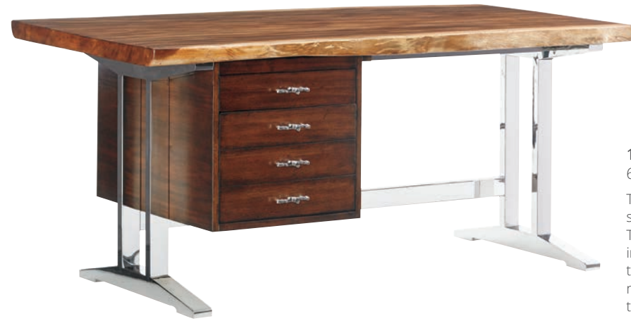
100NL-405 LaCosta Live Edge Writing Desk 68W x 36D x 30H in.

The LaCosta writing desk features a polished stainless base, Mahogany drawer unit and solid Trembesi live-edge top. The Trembesi tree, indigenous to islands in the South Pacific, has the look and characteristics of Black Walnut. Its natural live-edge offers a striking juxtaposition to the contemporary stainless base, giving the piece a unique designer look. The depth and shape of natural tops will vary. The drawer box includes two full extension drawers, with the lower drawer accommodating legal or letter files.