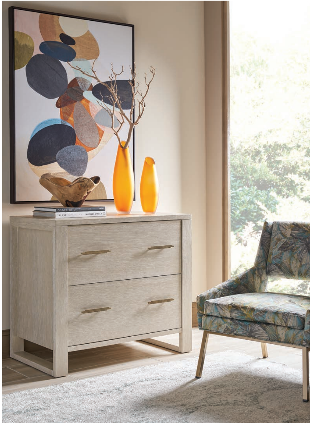
322-441 Hewitt Deck 38W x 16D x 51H in.

Stationary wooden shelf in the center, with an adjustable wooden shelf above and below. Vertical back panel with open area on the left and right. Open end panels. Complements 450 Hewitt File Chest.