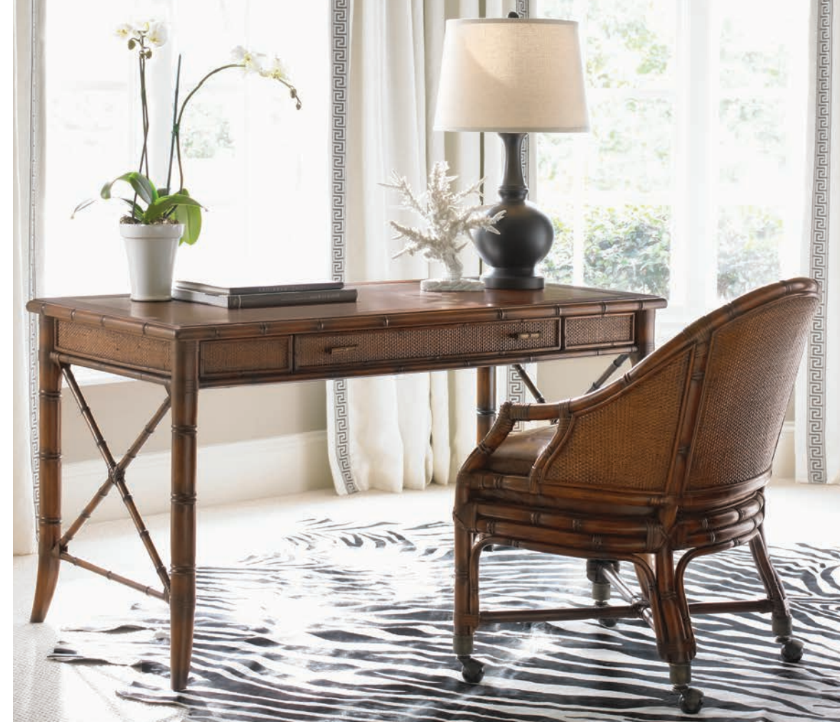
293SA-938-01 Rum Runner Game/Desk Chair 25.5W x 27D x 34H in.

The Marianna writing desk has a leather top framed with a Rosewood border. It has a single drop-front keyboard drawer in the center.