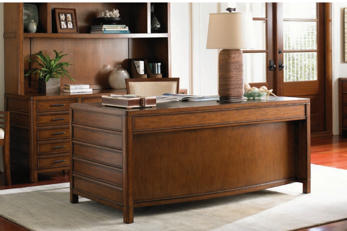
279LK-400 Bal Harbour Desk 68W x 35D x 30H in.

The Key Biscayne credenza offers generous storage and an optional deck unit. The left pedestal has three drawers, with the center and lower file drawers having a locking mechanism. The right pedestal has a drawer at the top and a door beneath, behind which is a pull-out tray that accommodates a printer.