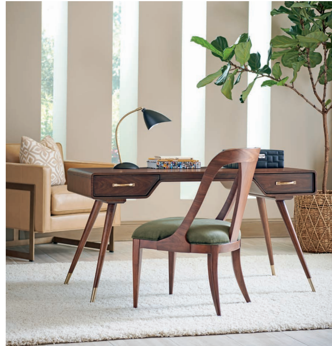
100TL-410 Cassina Writing Desk 56W x 26D x 30H in.

The 60-inch Irving writing desk is crafted from walnut in a deep mocha finish with woven cane accents on the offset drawer box. Custom oval hardware is finished in a champagne coloration. The design features a storage drawer above and a file drawer below that will accommodate letter or legal files. An integrated power unit with two USB jacks and two receptacles is mounted on the left side of the drawer box.