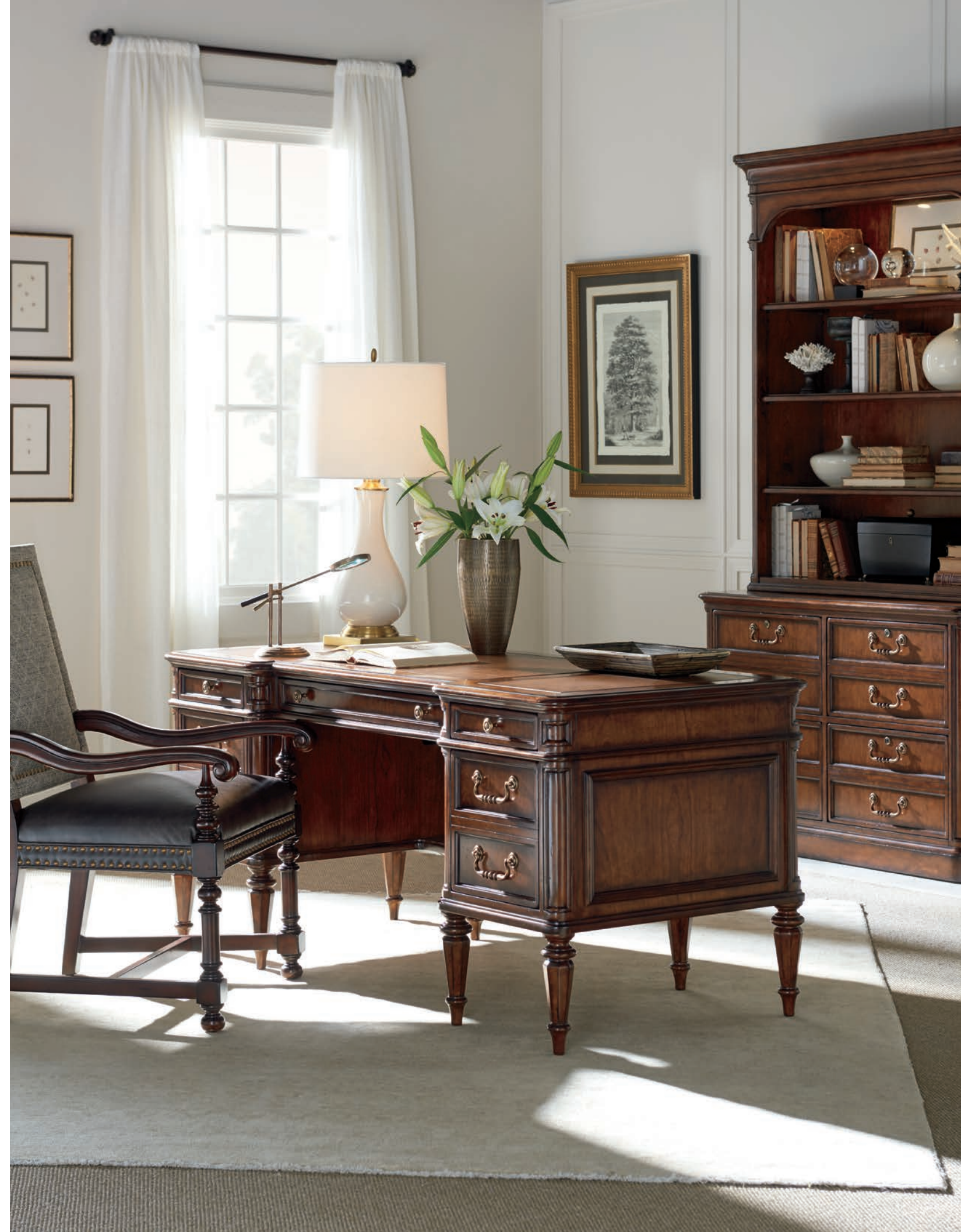
305-402 Wesley Desk 66W x 30D x 30H in.

With a 66 x 30-inch writing surface, the Wesley kneehole desk offers an elegant combination of form and function. The top of the desk features a Brisa leather writing surface with decorative tooling. The left and right sides have a full-extension self-closing drawer at the top and a full-extension file drawer below that will accommodate letter or legal files. The center drawer has a drop-front to accommodate a keyboard. There is a hidden storage shelf in the bottom section of the interior compartment.