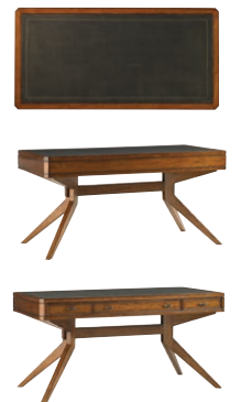
279LK-410 Lido Shores Desk 60W x 31D x 30H in. Leather top with gold tooling; 2 drawers; drop-front keyboard drawer with palm rest Shown on pages 36 and 37