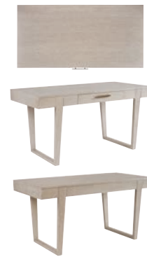
322-410 Revington Writing Desk 60W x 30D x 29.5H in. Knee space 39W x 24.25H in. Tapered open pedestal legs, quartered oak wooden top, one full-extension storage drawer. Shown on pages 22 and 23