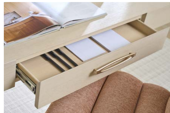
578-882 Aiden Channeled Upholstered Side Chair 21W x 26D x 37H in.

The 60-inch writing desk has a full-extension storage drawer and a beautiful architectural metal base finished in a soft champagne gold patina.