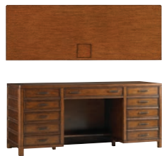
279LK-430 Key Biscayne Credenza 68W x 25.25 x 30H in. Knee space 28.25W x 23.5H in. Laptop docking station; data port; 5 outlet surge protector Left side facing: 3 drawers (locking center storage drawer, 1 locking full extension file drawer will accommodate legal or letter files) Center: drop-front keyboard drawer with ergonomic palm rest; kneehole shelf Right side facing: 1 door; 1 drawer; 1 adjustable shelf; 1 pull-out shelf for CPU/printer storage; cord management; ventilation Accommodates 279LK-440 Key Biscayne Deck Shown on pages 40 and 41