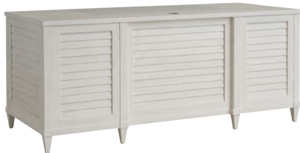
320-400 Bradenton Executive Desk 70W x 30D x 29.5H in.

The 70-inch Bradenton executive desk features 2 storage drawers and one locking file drawer in each pedestal, another storage drawer in the middle, a power unit with two receptacle and two USB jacks, and a Brisa leather writing surface.