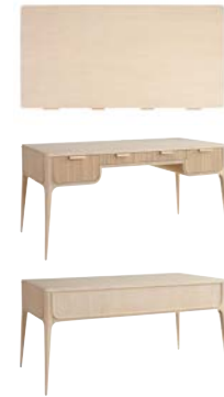
326-411 Montreux Writing Desk 61.5W x 31.5D x 29.5H in. Knee space 27W x 24.5H in. 3 storage drawers Shown on page 4