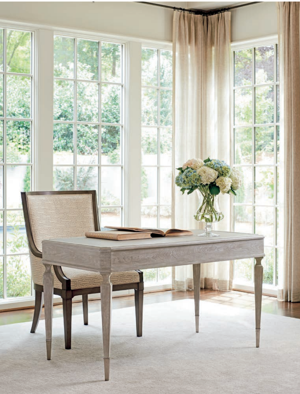
The 54-inch Chloe writing desk offers an elegant design that works equally well in a dedicated home office or in a bedroom work space. It features three storage drawers, metal ferrules in a brushed nickel finish and a writing surface of gray Brisa leather.