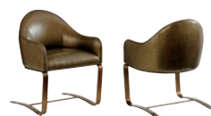
Shown in 9596-71 on pages 56 and 58