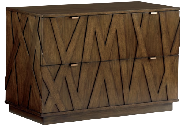
190-441 Prism Metal Deck 44W x 14D x 45H in.

The Prism file chest is a signature piece in the collection, showcasing asymmetrical wooden details on the drawers and end panels. The piece features two full-extension letter or legal file drawers. The file chest is designed to pair with the Prism metal deck, which offers three stationary glass shelves, a bronze mirror back panel and decorative metal fretwork on the end panels.