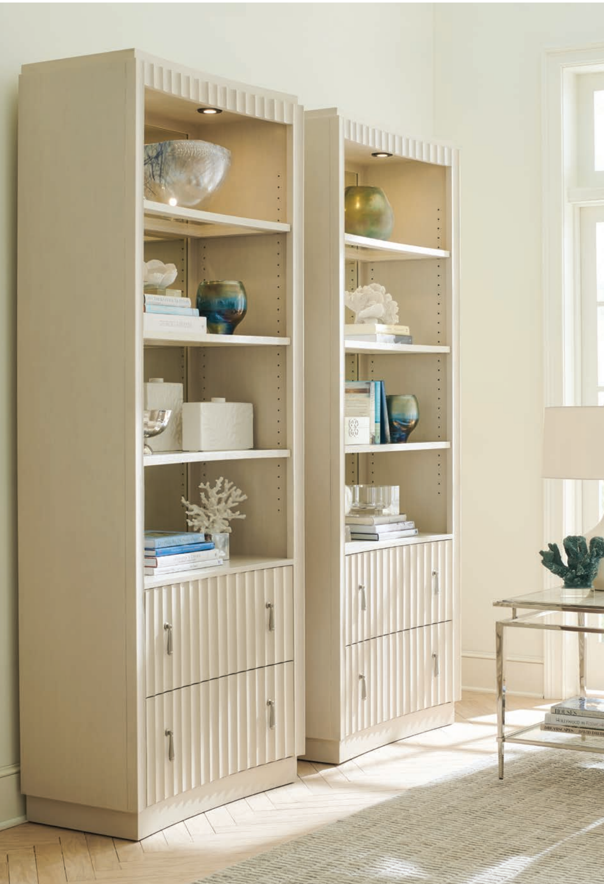
310-460 Walden Bookcase 36W x 18D x 91.75H in.

The 36-inch wide Walden bookcase features a gentle concave front, 3 wood-framed adjustable glass shelves, and touch LED lighting. In the lower section, 2 full-extension file drawers accommodate both letter and legal files. Custom-designed pendant hardware is finished in a brushed nickel finish.