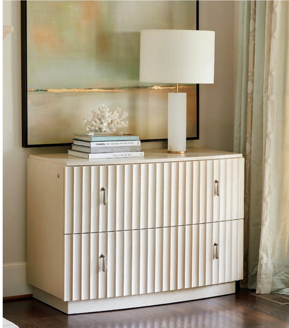
310-450 Birkdale File Chest 48W x 22.5D x 34H in.