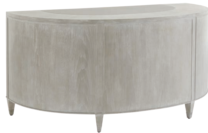
250-402 Dylan Demilune Desk 62.25W x 30.75D x 30H in.

The Octavia file chest features the collection's signature contemporary fretwork pattern on the drawers. Both drawers offer full-extension access to letter or legal files. The custom hardware and metal ferrules are finished in brushed nickel. The Octavia deck features touch LED lighting, three adjustable ultra-clear glass shelves and laser cut decorative fretwork on the end panels.