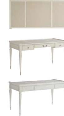
100AM-410 Fremont Writing Desk 58.75W x 28.75D x 30.75H in. Knee space 25W x 25H in. Maple veneers and select hardwoods in a smooth ivory finish with custom hardware in a polished nickel finish. Leather writing surface, 3 full extension drawers, removable dictation panel will work in either left or right side facing drawers, metal ferrules in a polished nickel finish. Shown on page 76 and Back Cover