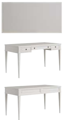
320-412 Valencia Writing Desk 54W x 28D x 29.5H in. Knee space 24.75W x 25H in. Brisa leather top, 3 storage drawers Shown on page 31