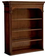
305-441 Lanier Deck 48.25W x 16D x 57H in. Complements the 450 Lanier File Chest 3 adjustable wood framed glass shelves, touch LED lighting with dimmer switch. Shown on pages 50 and 51