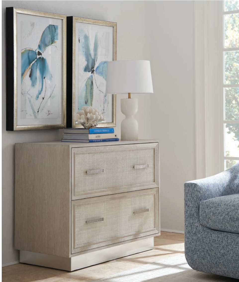
324-441 Wheaton Deck 41.5W x 14D x 51H in.

Metal frame and decorative fretwork in silver leaf finish with three stationary glass shelves. Open back. Complements 450 Wheaton File Chest.