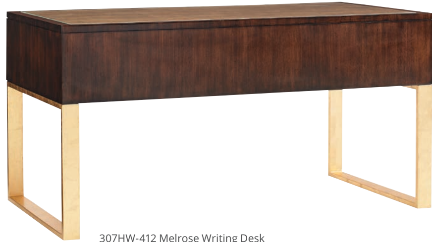
307HW-412 Melrose Writing Desk 59.5W x 30D x 30H in.