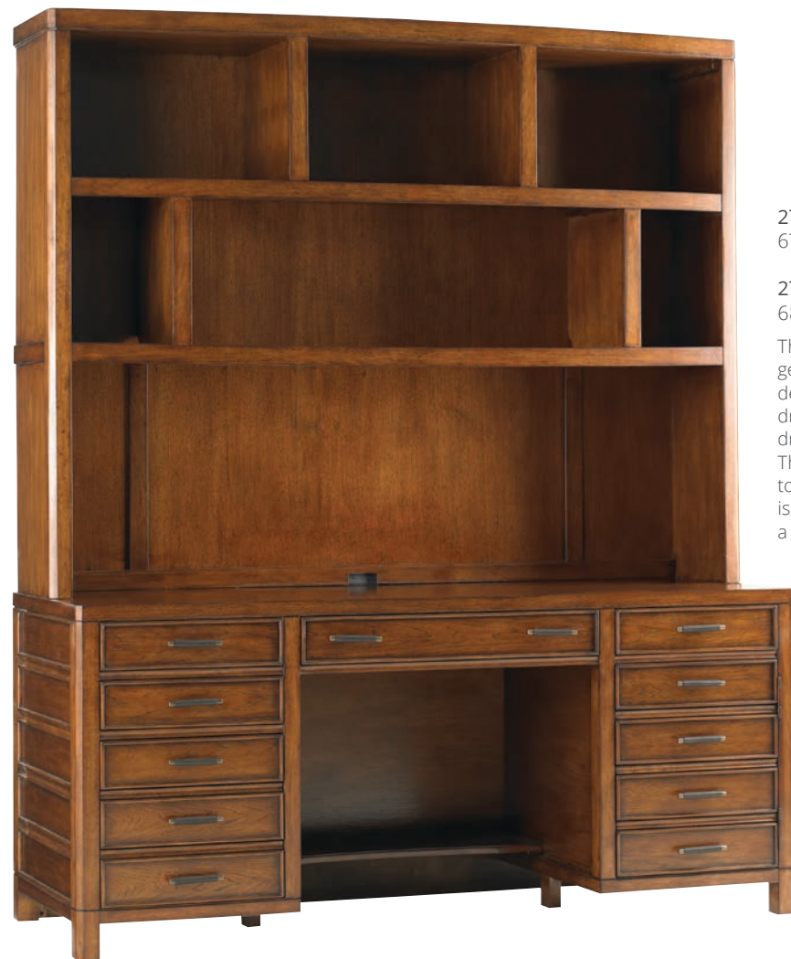
279LK-440 Key Biscayne Deck 67.5W x 16D x 52H in.