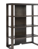
321-441 Hewitt Deck 38W x 16D x 51H in. Stationary wooden shelf in the center, with an adjustable wooden shelf above and below. Vertical back panel with open area on the left and right. Open end panels. Complements 450 Hewitt File Chest Shown on pages 26, 27 and 29