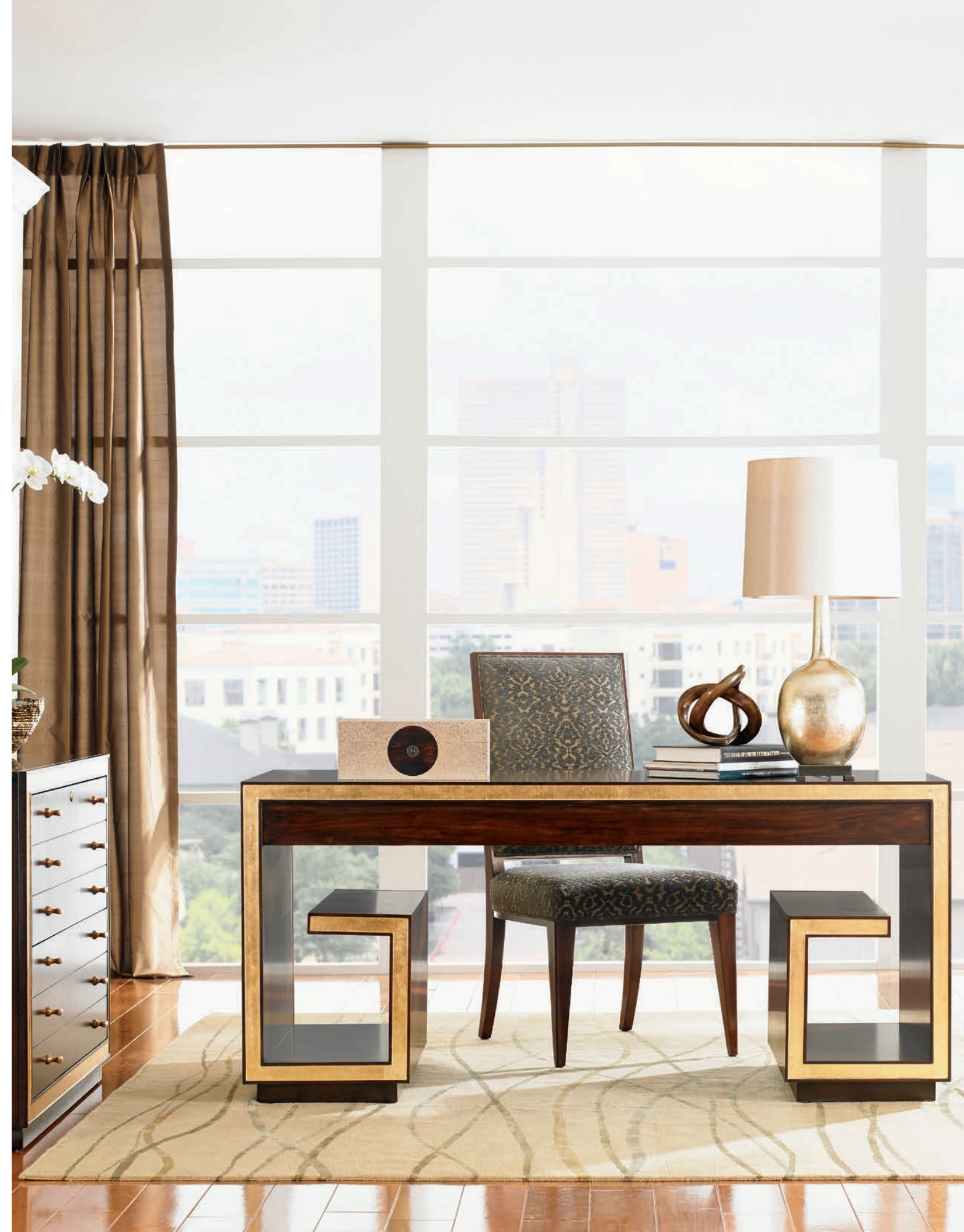
307HW-410 Brentwood Writing Desk 66W x 28D x 30H in.

The Beverly Palms file chest offers elegant supplemental filing, storage and display. The file chest features two extension file drawers with a lock on the top drawer.