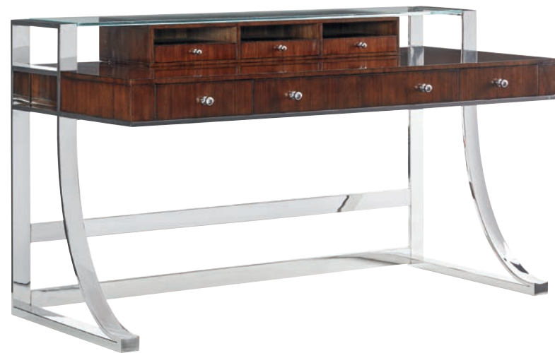
100WW-406 Andrea Writing Desk 62.25W x 28D x 35.5H in.

The LaCosta writing desk features a polished stainless base, Mahogany drawer unit and solid Trembesi live-edge top. The Trembesi tree, indigenous to islands in the South Pacific, has the look and characteristics of Black Walnut. Its natural live-edge offers a striking juxtaposition to the contemporary stainless base, giving the piece a unique designer look. The depth and shape of natural tops will vary. The drawer box includes two full extension drawers, with the lower drawer accommodating legal or letter files.