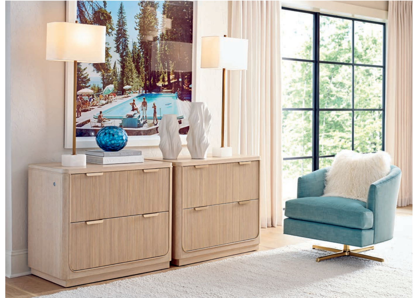
Two locking file drawers accommodate legal or letter files. Drawer fronts showcase a vertical reeded motif. Recessed plinth base.