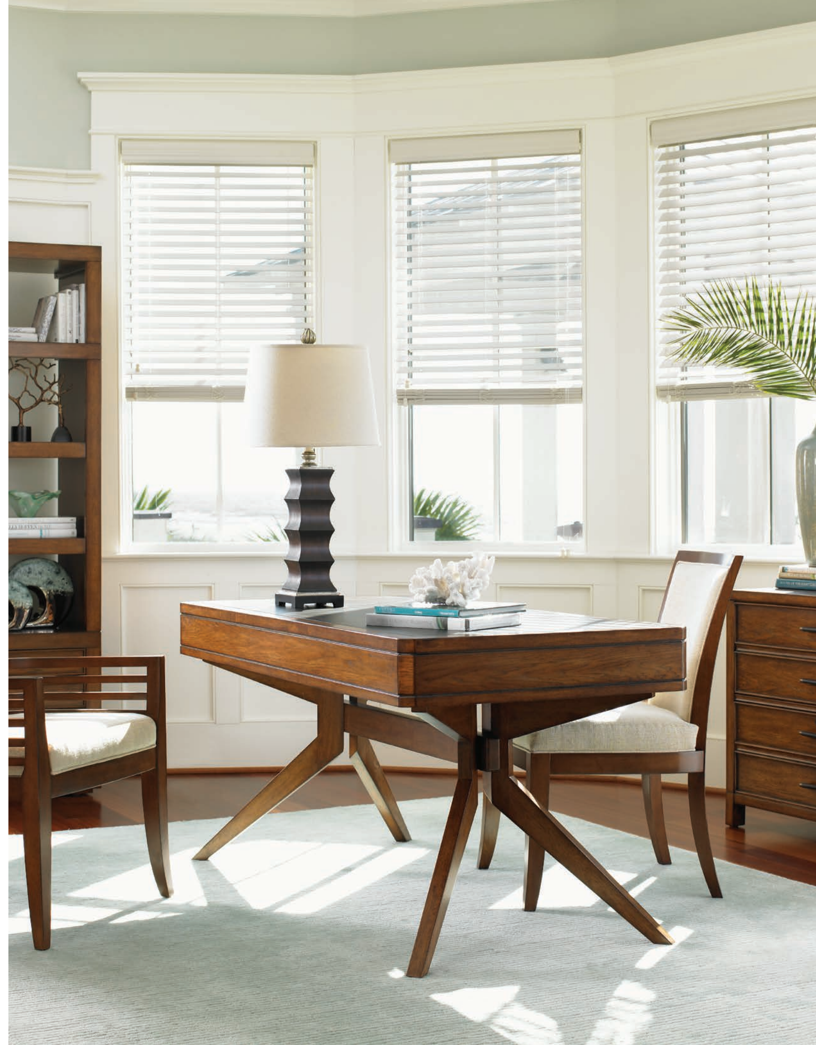
536-882-01 Kowloon Side Chair 22.25W x 24.5D x 36H in.

The Bay Shore file chest has two drawers that accommodate letter or legal files with a lock on the lower drawer. A unique wrapping of faux leather accents the burnished brass finish on custom drawer pulls.