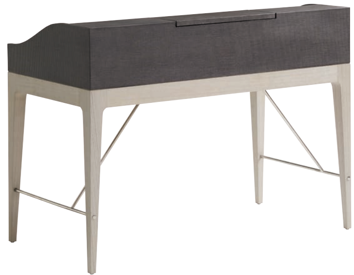
100LN-410 Anthology Linen Writing Desk 48W x 24D x 35H in.

The classic lines of the Fremont writing desk are crafted from maple, with a silky-smooth ivory finish. Custom hardware and metal ferrules are finished in polished nickel. The top surface features a graceful gallery edge around the perimeter and three Brisa leather inserts that are both durable and cleanable. Three full-extension drawers offer storage, with a removable writing surface that can be used on either the left or right facing drawer.