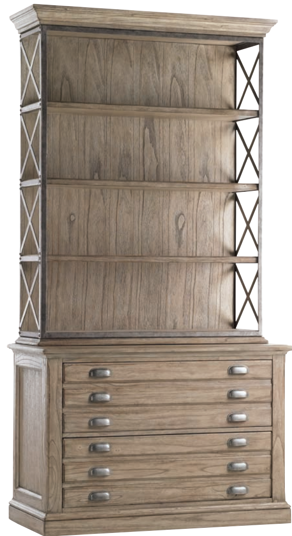
300BA-441 Johnson Deck 45.25W x 15D x 57.25H in.