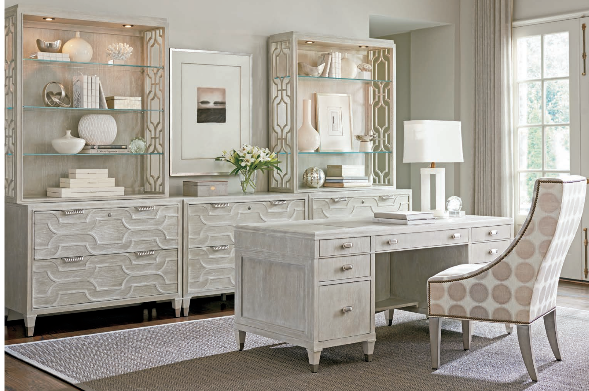
The Avery executive desk offers ample storage and functionality for the most serious of working professionals. The design features four storage drawers and two letter or legal file drawers. The concave front design and recessed front and side panels give the silhouette a striking presence. The inset writing surface is gray Brisa leather.