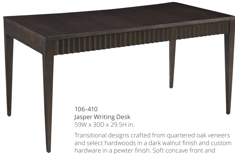
106-410 Jasper Writing Desk 59W x 30D x 29.5H in.

Transitional designs crafted from quartered oak veneers and select hardwoods in a dark walnut finish and custom hardware in a pewter finish. Soft concave front and tapered legs. Three full-extension storage drawers with undulating fronts.