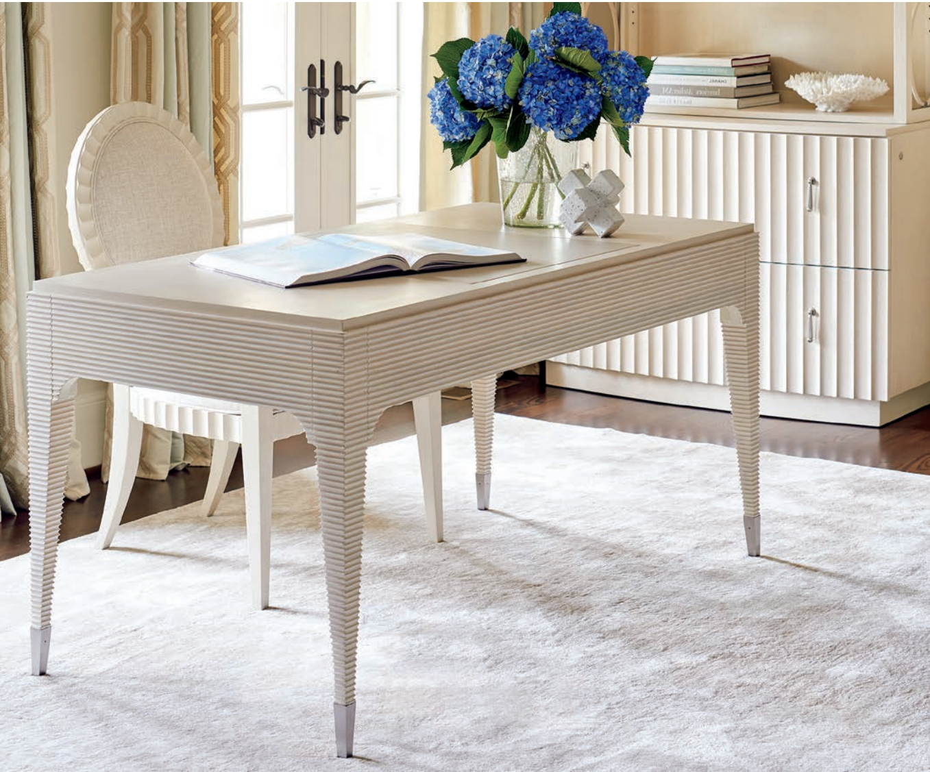
310-411 Roslyn Writing Desk 60W x 30D x 30H in.

Inspired by the timeless elegance of Hollywood Regency and Art Deco styling, designs in Cascades feature scalloped detailing that accentuates the graceful lines and curved fronts that define the distinctive look. Crafted from white oak veneers, pieces are lightly wire-brushed and finished in a fresh linen-white coloration, with custom hardware and ferrules in brushed nickel. The portfolio of designs includes desks, files chests and bookcases for the home office, media consoles in two sizes, and a game table with stationary and castered chairs.