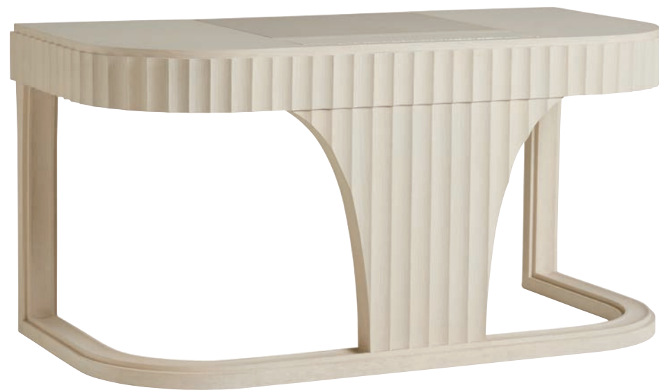
310-410 Caledonia Desk 60W x 30.75D x 30H in.

The 60-inch Caledonia writing desk offers a distinctive shelter design with returns on the front that soften the profile while highlighting the elegant scalloped detailing. The front panel serves as a privacy channel for cord management. The top has an inset leather writing surface and a hidden compartment, accessed by touch-latch, with two power outlets and two USB ports. There are three full-extension storage drawers on the working side of the desk.