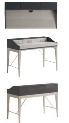
100LN-410 Anthology Linen Writing Desk 48W x 24D x 35H in. Knee space 44W x 23.75H in. Linen wrapped deck and end panels. Crafted from select hardwoods and eucalyptus veneers in a gray finish with custom designed acrylic hardware. Touch latch reveals a recessed mounted unit with 2 outlets and 2 USB power jacks with tamper resistant receptacles and cord management. Three storage drawers. Pull-out top creates storage area with removable partitions, cord management. Shown on pages 76 and 77