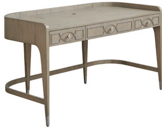
100SD-410 Hamilton Writing Desk 60W x 28D x 31.5H in.

This neo-classical design features an elegant curved front, crafted from quartered ash veneers, in a wire-brushed dove gray finish. In addition to three drawers, there is a storage compartment in the top accessed by a lift-lid. The piece also features metal ferrules on the legs in a brushed nickel finish.