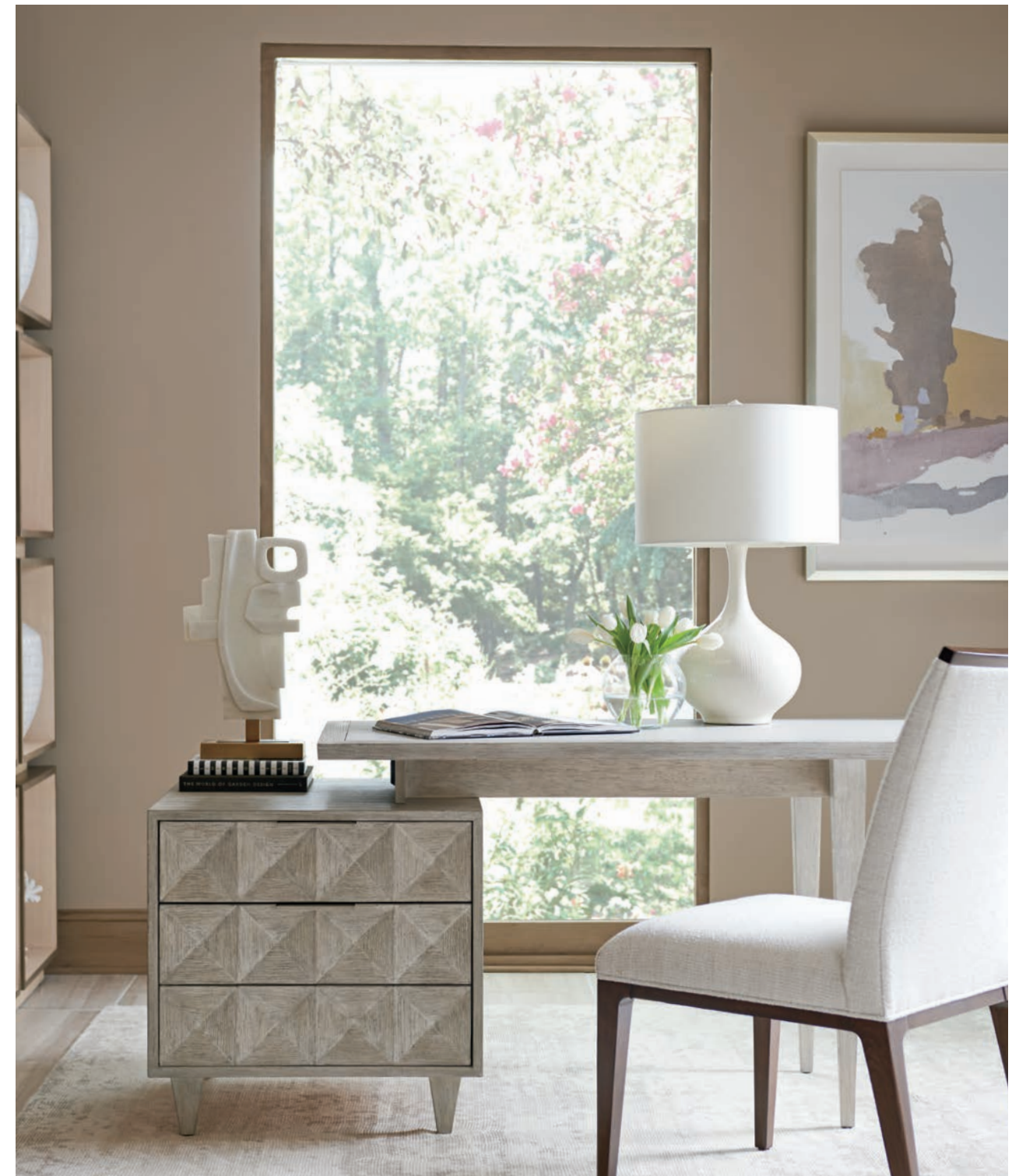
100CD-410 Domus Writing Desk 64W x 26D x 29.75H in.

The contemporary offset design of the 64-inch Domus writing desk is crafted from quartered oak veneers in a sandblasted and wire-brushed light gray finish with custom brushed nickel hardware. The drawer box on the left side features a concave geometric design with a storage drawer above and a file drawer below that will accommodate letter or legal files. The inset Brisa leather writing surface is both durable and cleanable, and the desk incorporates an integrated power unit with two USB jacks and two receptacles.