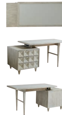
100CD-410 Domus Writing Desk 64W x 26D x 29.75H in. Knee space 26.75W x 24.75H Contemporary offset silhouette crafted from quartered oak veneers and select hardwoods in a sandblasted and wirebrushed light fog gray finish and custom brushed nickel hardware. 1 storage drawer and 1 file drawer with geometric concave overlays. The file drawer will accommodate legal or letter files. Faux leather writing surface. Mounted 2 powered USB power jacks with tamper resistant receptacles and cord management. Shown on page 81