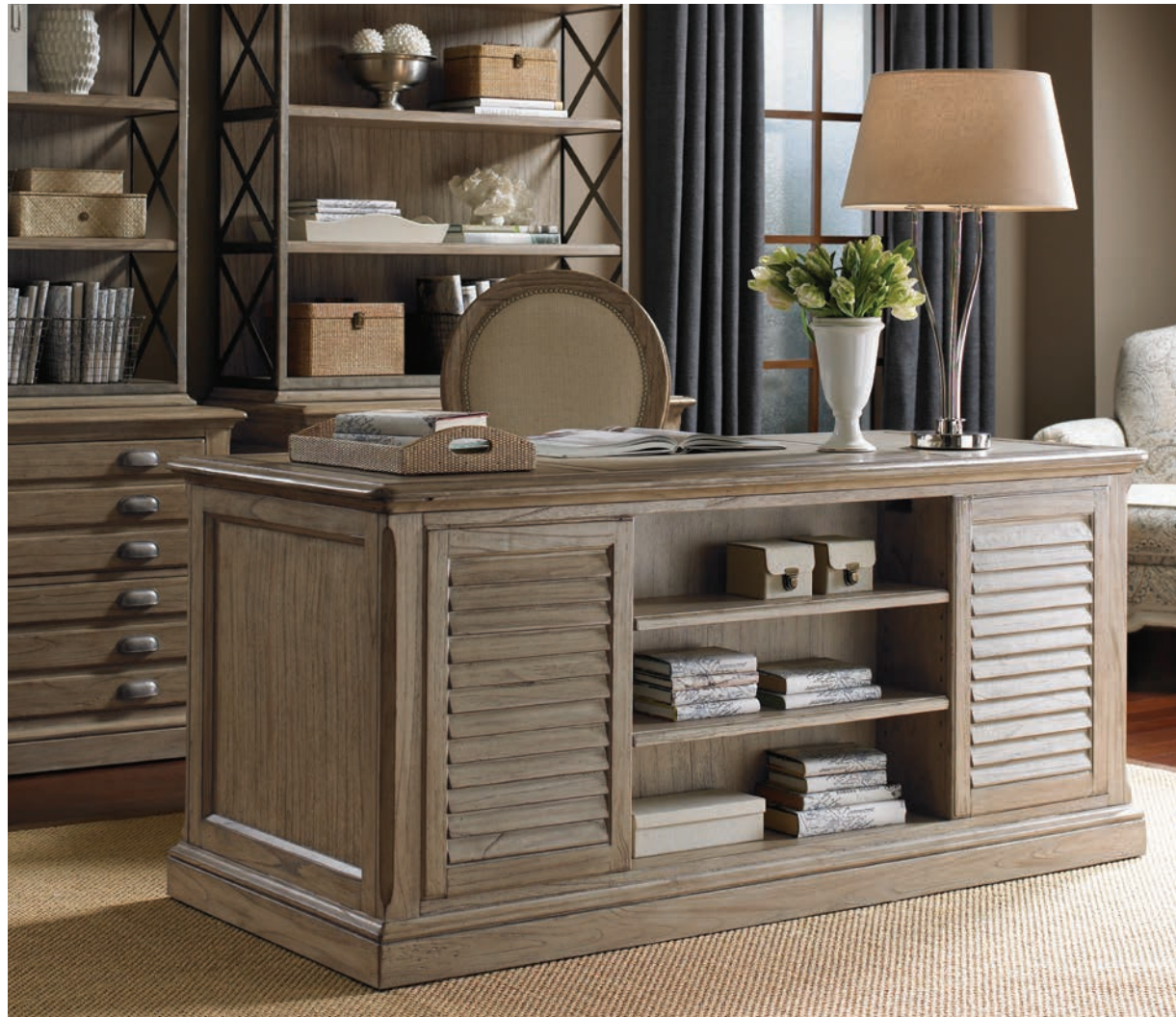
300BA-411 Austin Desk 66W x 30D x 30H in.

The back of the Austin desk features a plantation shutter design flanking two adjustable shelves. The working side includes a drop-front center drawer with ergonomic palm rest, four storage drawers, and two file drawers. The writing surface has three custom inserts in a sophisticated gray leather.