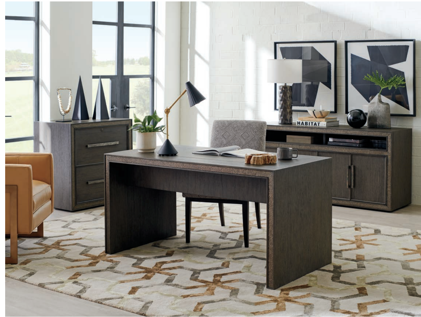
102-450 Chapman Lateral File 32.75W x 23D x 34H in.

The 66-inch Hampton console is designed to function as a home office credenza or media console. Custom hardware and the textured inlay are finished in nickel with a dark glaze. The open compartment at the top accommodates a sound bar or book storage. Behind the doors on the left are a storage drawer and a file drawer that will accommodate letter or legal files. Behind the doors on the right are two adjustable shelves. This design is also available in a 96-inch version. The style number is 102-661.