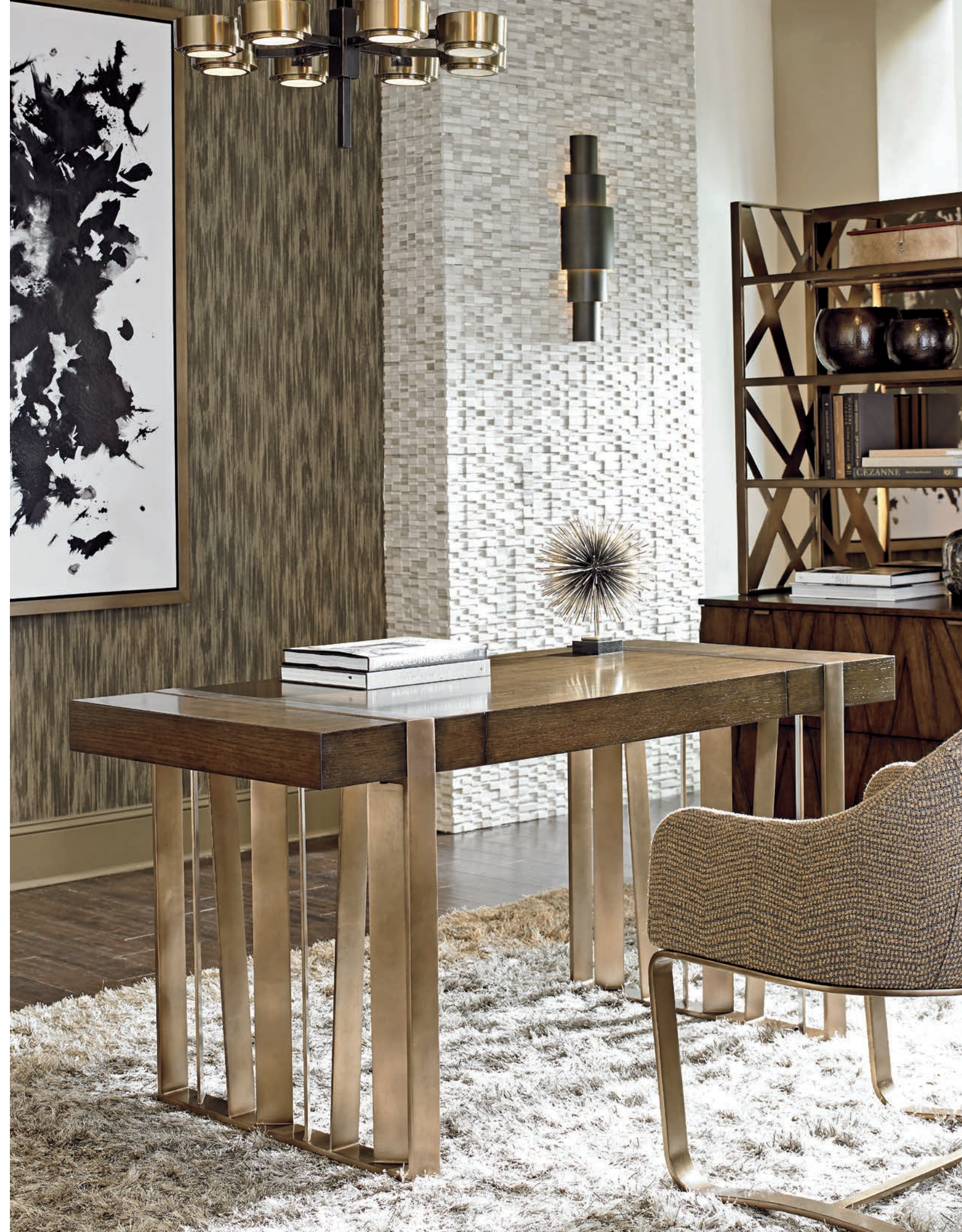
190-410 Intersect Writing Desk 60W x 27D x 29.5H in.

The 60 x 27-inch Intersect writing desk offers dramatic styling in a compact footprint. Asymmetrical metal slats support the wooden top, which incorporates a single drawer in the middle.