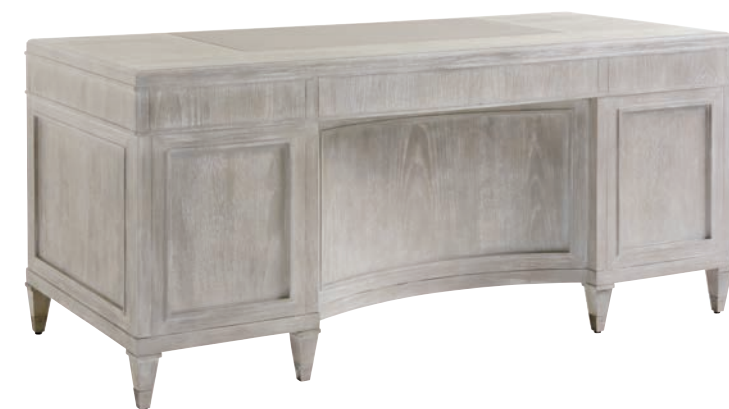
250-400 Avery Executive Desk 68.5W x 30.5D x 30H in. 1500-13 Stonepine Chair 24.5W x 30D x 42H in.