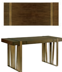
190-410 Intersect Writing Desk 60W x 27D x 29.5H in. Metal base with asymmetrical metal slats. Single pencil drawer in center. Some assembly required Shown on page 57