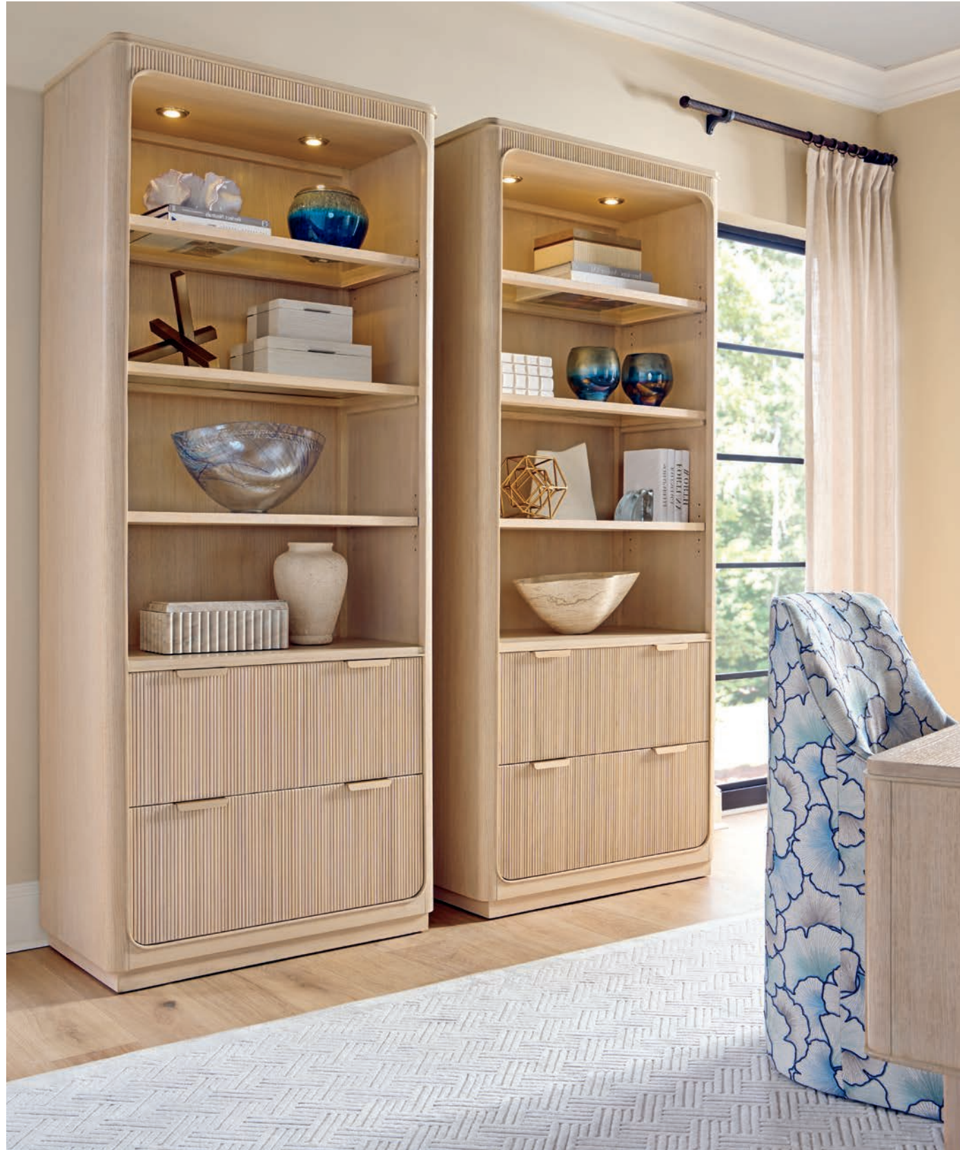
The 90-inch high bookcases feature three wood-framed tempered glass shelves. The middle shelf is stationary and the upper and lower shelves are adjustable. A pair of LED lights are recessed in the top and operate with a dimmer switch. Two file drawers at the bottom accommodate legal or letter files. Recessed plinth base.