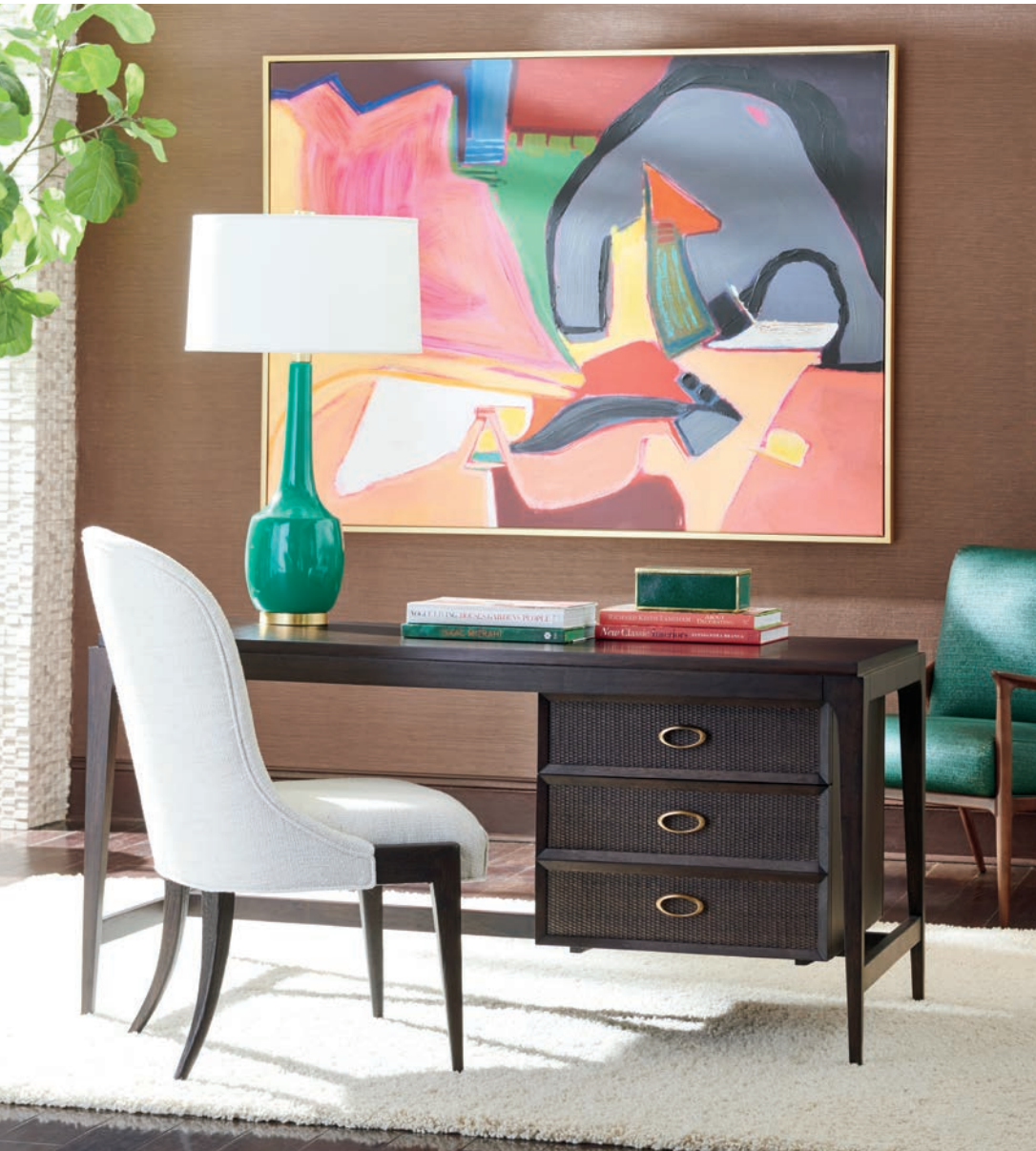
100OD-410 Irving Writing Desk 60W x 30D x 29.5H in.

The 60-inch Irving writing desk is crafted from walnut in a deep mocha finish with woven cane accents on the offset drawer box. Custom oval hardware is finished in a champagne coloration. The design features a storage drawer above and a file drawer below that will accommodate letter or legal files. An integrated power unit with two USB jacks and two receptacles is mounted on the left side of the drawer box.