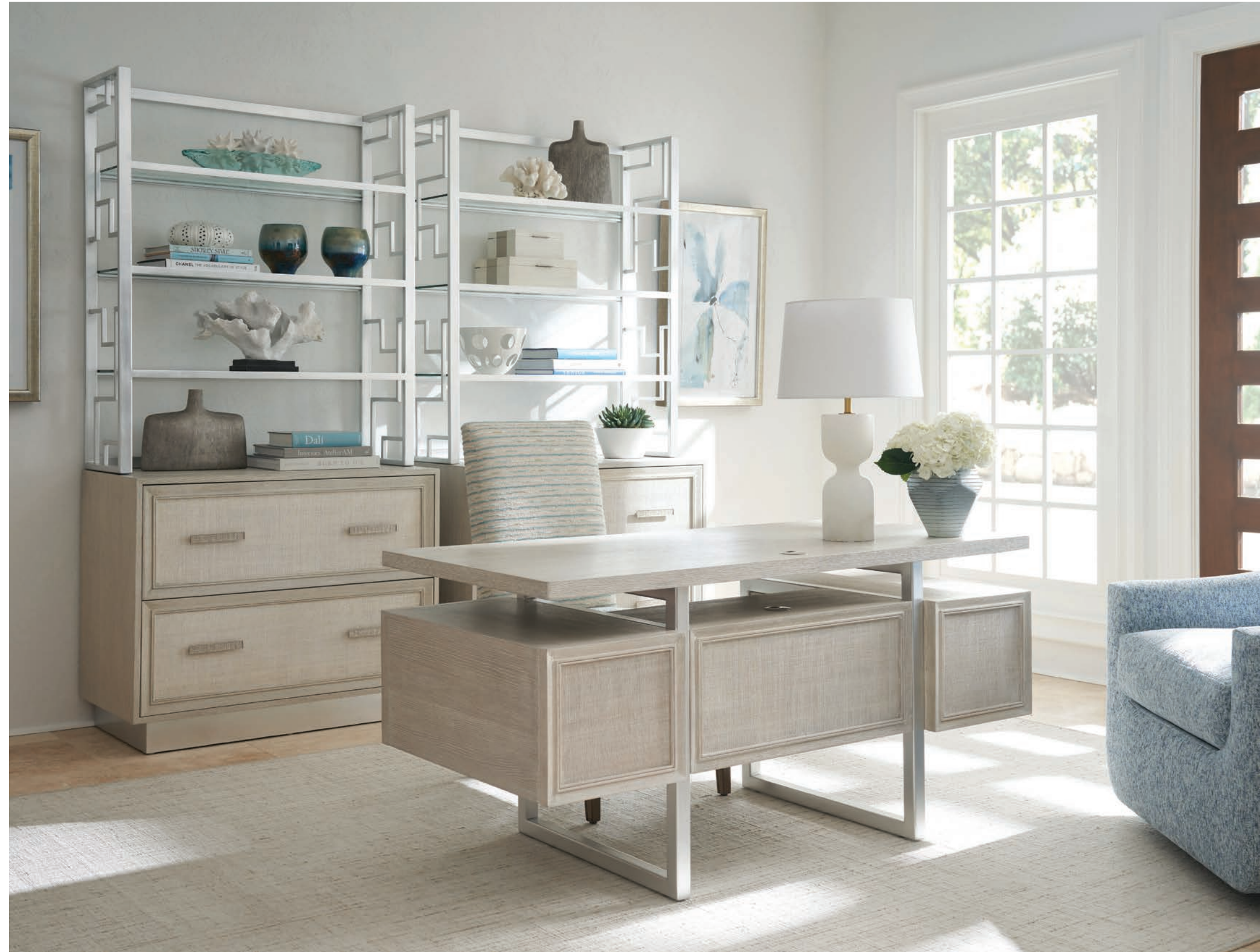
725-880 Metro Side Chair 20W x 27D x 41H in.

Two file drawers with raffia fronts accommodate legal or letter files. Recessed metal plinth base has a silver leaf finish.