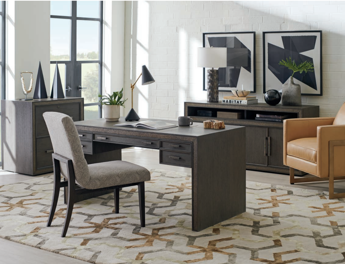
102-412 Chapman Writing Desk 60W x 30D x 30H in.

The 60-inch Chapman writing desk is crafted from sandblasted oak veneers in a rich graphite finish. A textured cast inlay band frames the perimeter of both sides of the design. Custom hardware and the textured inlay are finished in nickel with a dark glaze. Across the front are three storage drawers. The left and right facing drawers include divided organizer inserts. The inset Brisa leather writing surface on the top is both durable and cleanable.