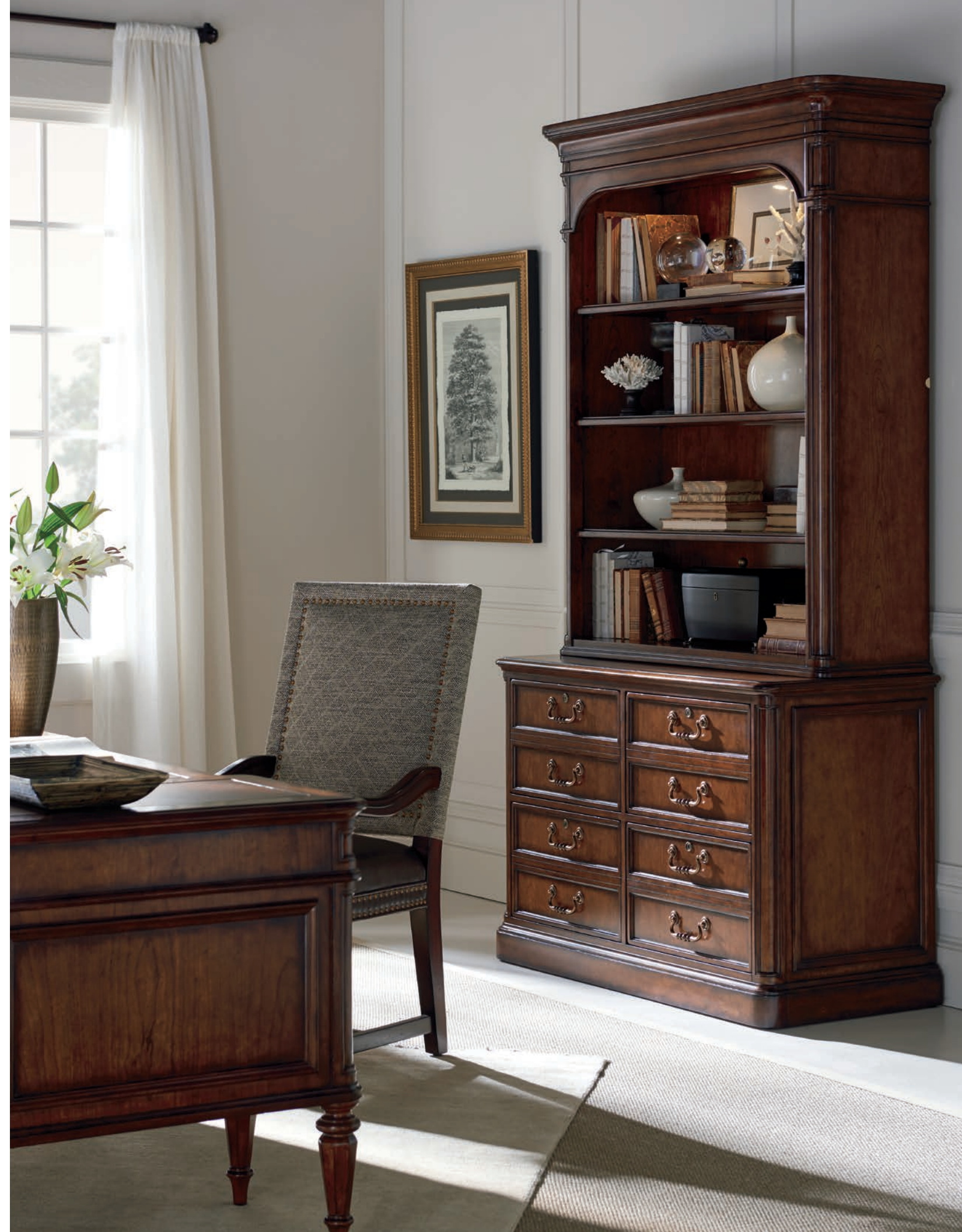
305-441 Lanier Deck 48.25W x 16D x 57H in.