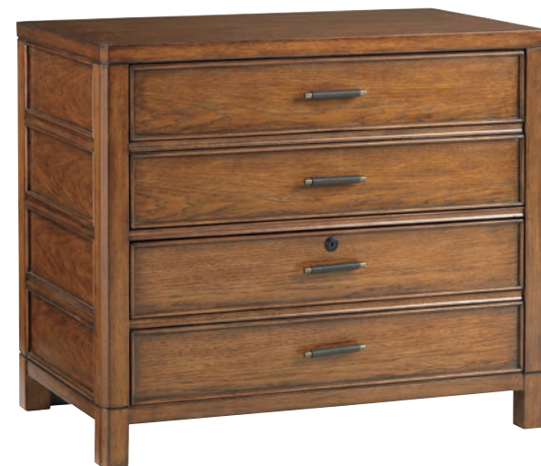
279LK-450 Bay Shore File Chest 35W x 22.5D x 30H in.

The 60-inch Lido desk offers a striking approach to architectural design. There are three storage drawers, with the center drawer having a drop-front to accommodate a keyboard. The leather writing surface has gold tooling around the perimeter.