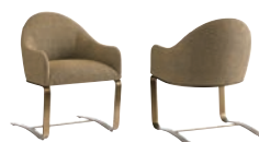
190-438 Icon Desk Chair 24.25W x 24.75D x 33H in. Arm 24H in. Seat 20W x 19.25D x 19H in. Metal base and upholstered seat. Available in COM, any Lexington Upholstery fabric or Lexington Upholstery leather. Shown in fabric 4109-71 on pages 57 and 60