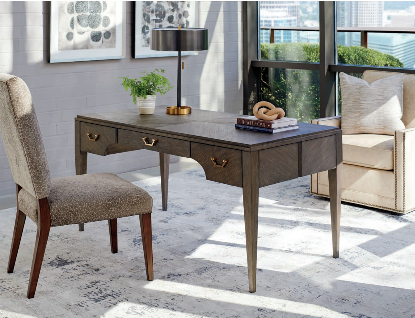
103-410 Bennett Writing Desk 60W x 30.75D x 29.5H in.