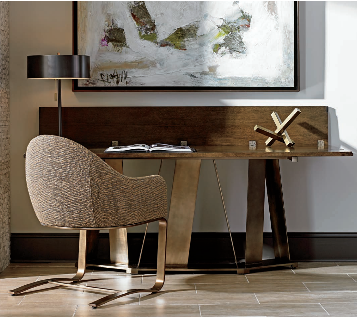
190-438 Icon Desk Chair 24.25W x 24.75D x 33H in.

The Gateway flip-top console is the most innovative design in the collection. It has a striking asymmetrical metal base, functioning as an elegant wall piece, a work table, or even an apartment-sized dining table for four. The top measures 72 x 20-inches with both leaves in the closed position, and a generous 72 x 40-inches with the flip tops open.