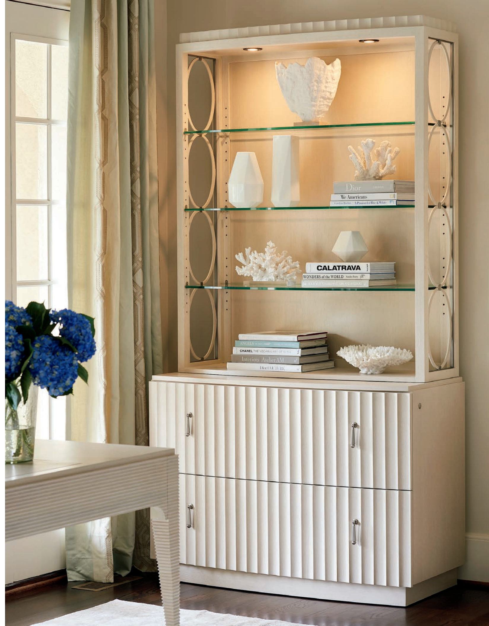
310-441 Birkdale Deck 46W x 15D x 57.25H in.

The 46-inch Birkdale file chest features two full-extension locking file drawers that accommodate letter or legal files. The deck features three adjustable glass shelves, touch LED lighting, and metal accents in brushed nickel. The smaller Ramsey mobile file chest offers a full-extension storage drawer at the top and a file drawer beneath.