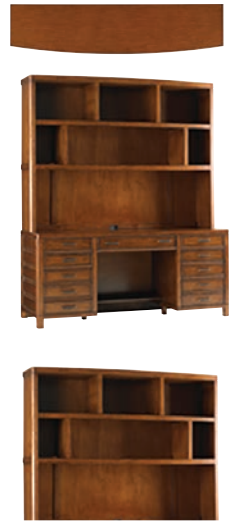
279LK-440 Key Biscayne Deck 67.5W x 16D x 52H in. Open storage compartments; task lighting; cord management Complements 279LK-430 Key Biscayne Credenza Shown on pages 40 and 41