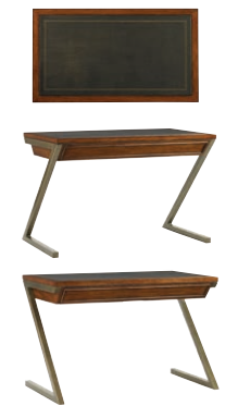
279LK-411 Harborview Desk 46W x 27D x 30H in. Leather top; metal legs; 1 storage drawer with wood dividers Shown on page 39