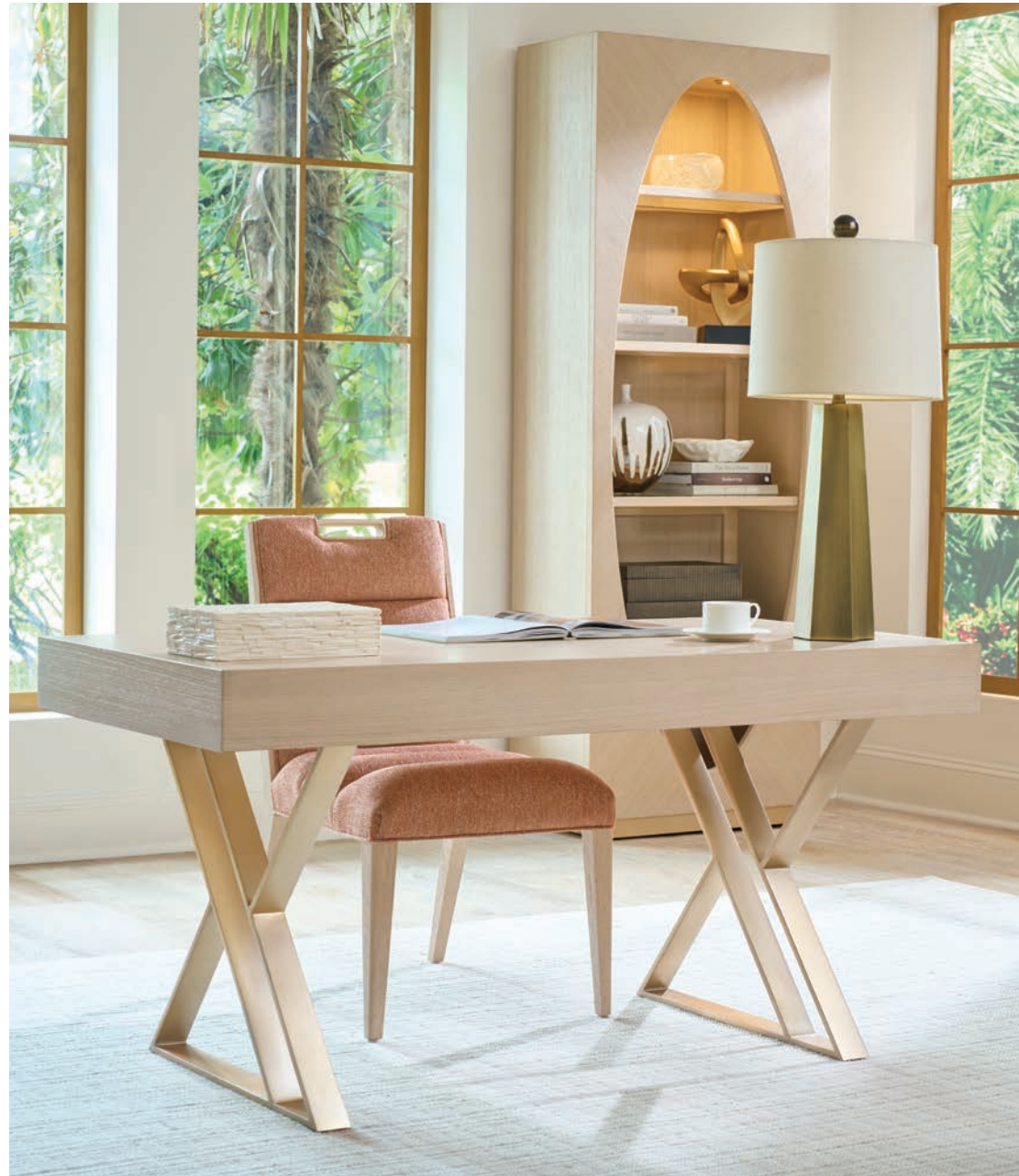
325-410 Apogee Writing Desk 60W x 30D x 29.5H in.

The Apogee collection features striking contemporary designs crafted from white oak in a light Sandstone finish with gentle wire brushing to accentuate natural grain lines. In addition to a free-standing writing desk, the portfolio includes modular components to enable flexible configurations. Custom hardware features an elegant champagne finish.