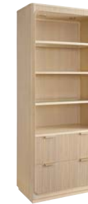
326-460 Montreux Bookcase 37.25W x 20D x 90H in. 3 wood framed tempered glass shelves, 2 adjustable with stationary middle shelf, touch LED puck lights with dimmer switch, 2 file drawers, accommodate legal or letter files. Touch plate is mounted to the right side facing panel 60-inch from the floor Shown on pages 4, 5 and 6