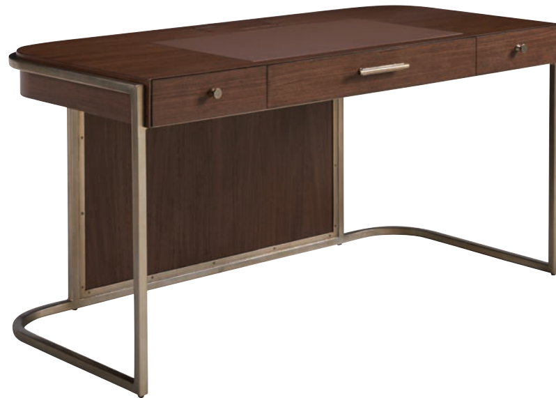
104-450 Berwick File Chest 36W x 23D x 35.5H in.

Contemporary designs crafted from quartered walnut veneers and select hardwoods in a dark walnut finish. Metal base in a warm silver leaf finish, modesty panel, Brisa leather writing surface, 3 full-extension storage drawers, touch latch in center top reveals 2 plug power supply with 2 USB charging jacks.