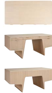
326-410 Montreux Executive Desk 70.5W x 34.5D x 29.5H in. Knee space 27.5W x 24.75H in. 3 storage drawers, 2 file drawers that accommodate legal or letter files, base has metal ferrules Shown on page 5