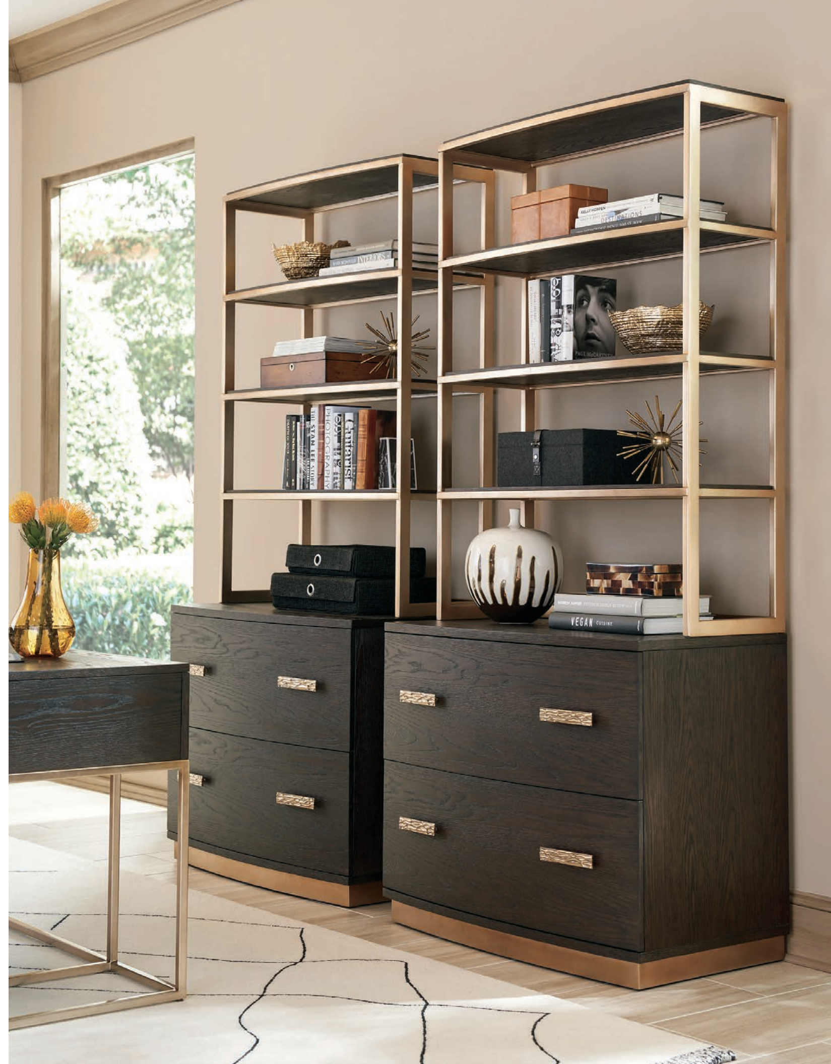
323-441 Carson Deck 37.5W x 15.5D x 53H in.

The metal frame, in gold burnished silver leaf, has three stationary wooden shelves with open back and end panels. Complements the 450 Carson File Chest.