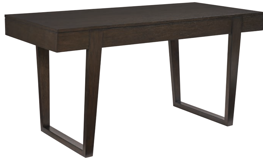
321-441 Hewitt Deck 38W x 16D x 51H in.

The 60-inch writing desk features tapered open pedestal legs and a full-extension drawer for storage.