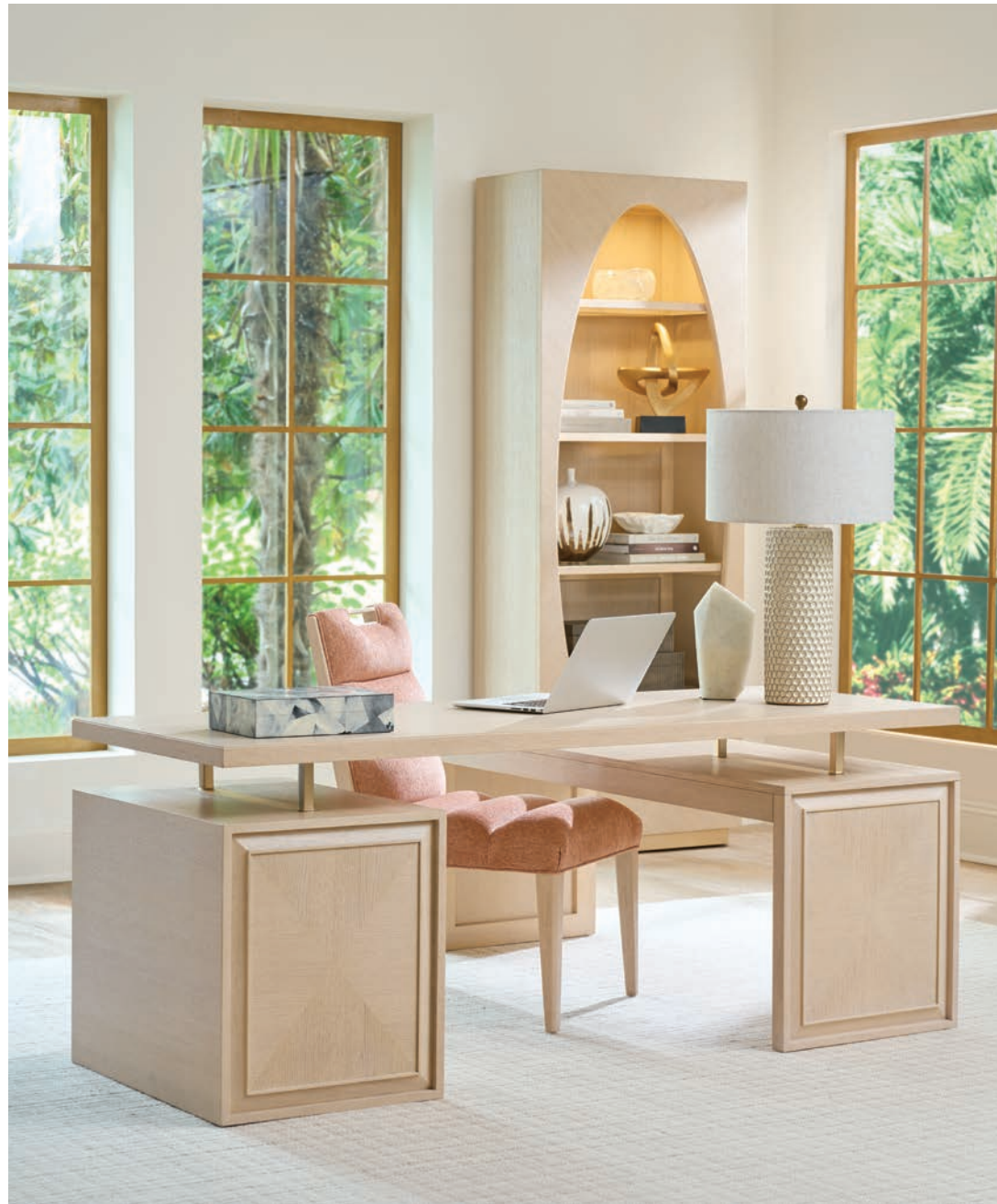
325-420 Apogee Modular Top 74W x 28D x 1.75H in.

The modular configuration shown is comprised of three items: a file chest, a modular return and a modular top. The return can be configured on the left or the right. This arrangement offers multiple working surfaces at different heights as well as storage beneath the top surface.