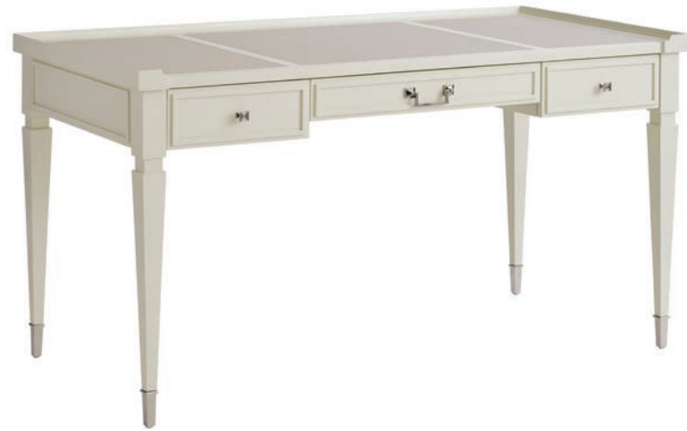
100AM-410 Fremont Writing Desk 58.75W x 28.75D x 30.75H in.

The classic lines of the Fremont writing desk are crafted from maple, with a silky-smooth ivory finish. Custom hardware and metal ferrules are finished in polished nickel. The top surface features a graceful gallery edge around the perimeter and three Brisa leather inserts that are both durable and cleanable. Three full-extension drawers offer storage, with a removable writing surface that can be used on either the left or right facing drawer.