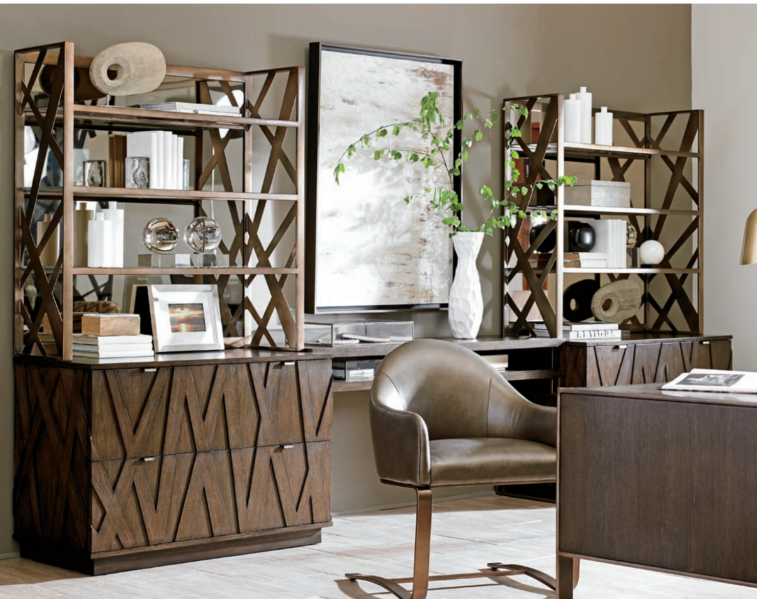
556-884 Cole's Bay Side Chair 20.25W x 26.75D x 40.5H in.

The 60-inch Kinetic office console, featured on the opposite page, offers the versatility of a narrow writing desk, a sofa table, or a bridge unit between a pair of Prism file chests.